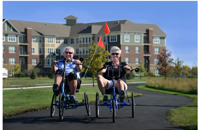
Senior housing in Forest Lake, Washington County

Minnesota Department of Human Services (DHS) works to ensure appropriate housing is available for those needing an integrated approach to housing, services, and income supports and that enables people to live in the community of their choice. DHS administers the General Assistance , Group Residential Housing , Minnesota Supplemental Aid , and Section 811 Project-Based Rental Assistance programs, and coordinates services for people experiencing or at risk of long-term homelessness. DHS also promotes three free information and assistance services: