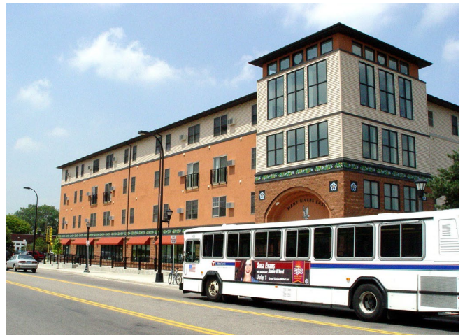
Many Rivers on Franklin Avenue in Minneapolis

Center for Energy and Environment (CEE) promotes energy efficiency to strengthen the economy and improving the environment. It offers a “one-stop” approach to helping homeowners make energy improvements and operates as a non-traditional lender with flexible financing for homeowners and multifamily property owners for energy efficiency and rehabilitation.