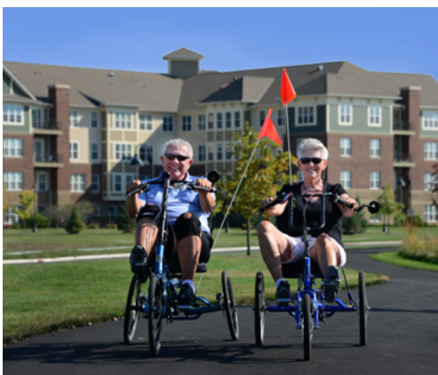
Older residents indicated that they like living in Maple Grove, noting natural areas as an asset, including 80+ miles of trails and 150 miles of sidewalks.