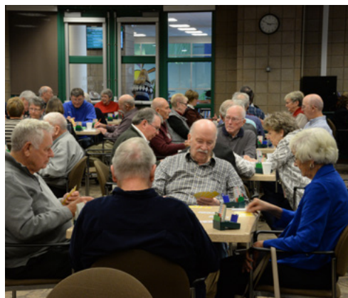
The City offers a wide variety programs and opportunities. Pickleball and bridge are both wildly popular and each may have nearly 100 people participating.