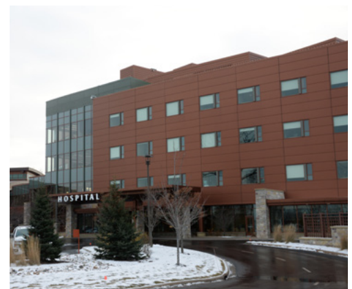
Maple Grove Hospital and Fairview Health Services are supporters of the AF-MG initiative and collaborative committee members.