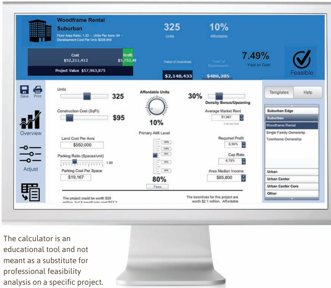
Figure 1: Sample page from the Mixed Income Housing Calculator

The calculator is an educational tool and not meant as a substitute for professional feasibility analysis on a specific project.