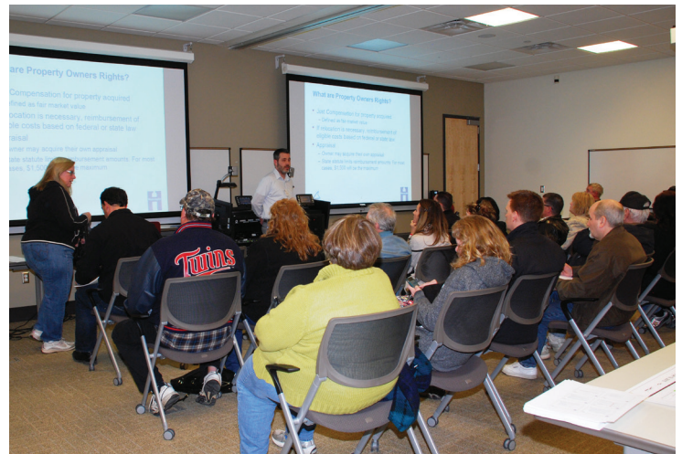
Property owners learn about the acquisitions process at an informational meeting in Brooklyn Park.

The acquisitions can include either permanent easements on a property, such as an easement for drainage, a trail or a storm water pond. Or, work may require a temporary easement, such as allowing workers to use property during a construction period. Full ownership then reverts back to the owner after the project is complete.