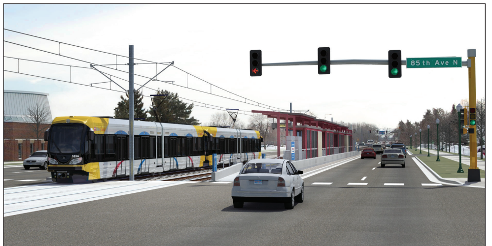
Top: A METRO Blue Line light rail train passes through a residential area near the Veterans Administration Medical Center in south Minneapolis.