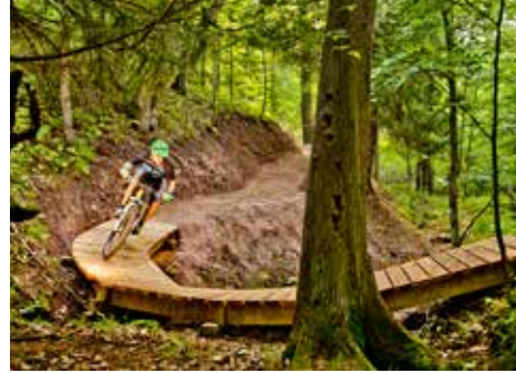
develop... Enjoy the new purpose-built Duluth Traverse mountain bike trail in Mission Creek, City of Duluth.