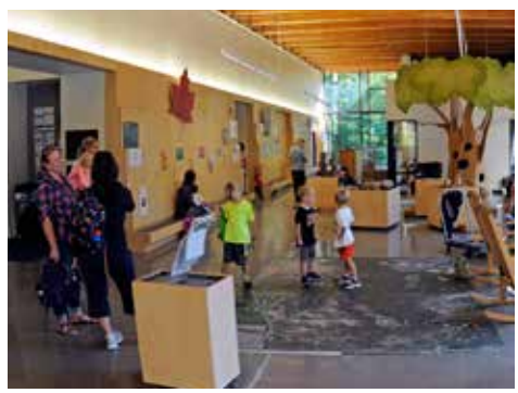
take care... Visitors interact and learn at the Eastman Nature Center – Three Rivers Park District.