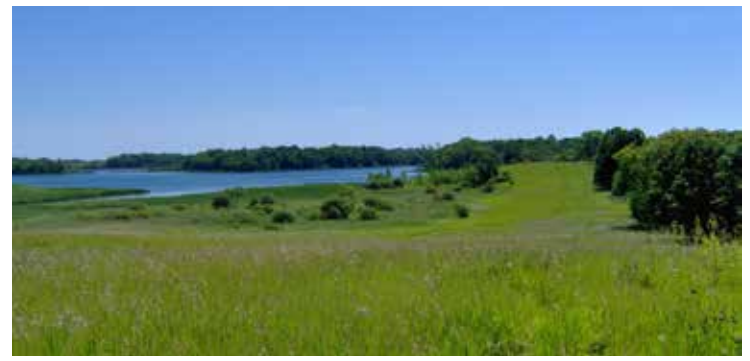
acquire... The Central Lakes State Trail bisects this 140-acre Legacy project - Lake Brophy Park, Douglas County.