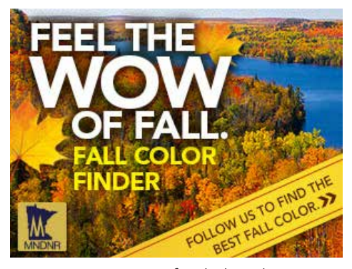
connect... A Legacy-funded marketing campaign helped increase state park visits and permit sales.