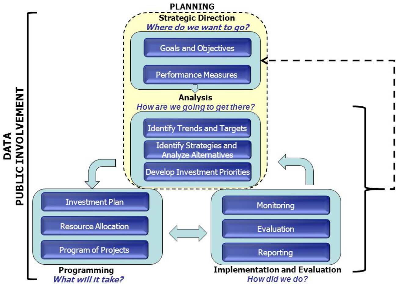
Figure 1-1 – Performance-based Planning Framework