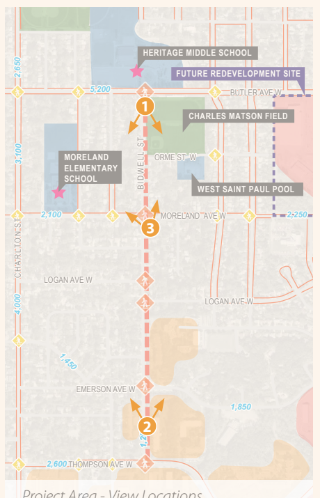
Project Area - View Locations