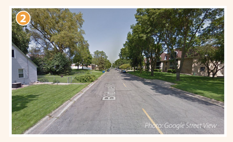
Existing Site Photo: Bidwell Street looking north from Thompson Avenue. The Bidwell Street Sidewalk Improvements will provide pedestrian connections to single family and multi-family residences, as shown here.