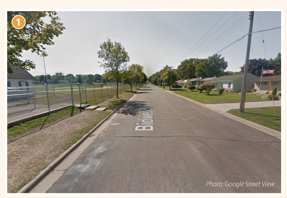
Existing Site Photo: Bidwell Street looking south from Butler Avenue at Heritage Middle School. A path has been worn in the project location, where students typically walk to avoid sharing the road with