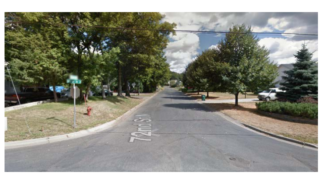
72<sup>nd</sup> Street facing east at Warner Road (Google Maps).