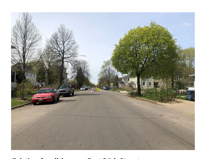
Existing Conditions on East 34th Street