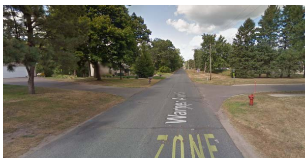
Warner Road facing north at south School entrance.