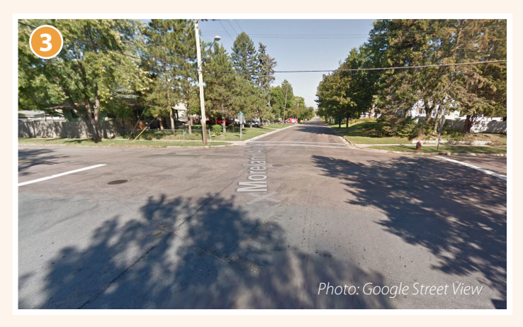
Existing Site Photo: 4-way stop along Bidwell Street at the intersection of Moreland Ave W, facing north, to the east of Moreland School. The Bidwell Street Sidewalk Project will provide safer pedestrian crossings to connect residents to schools.