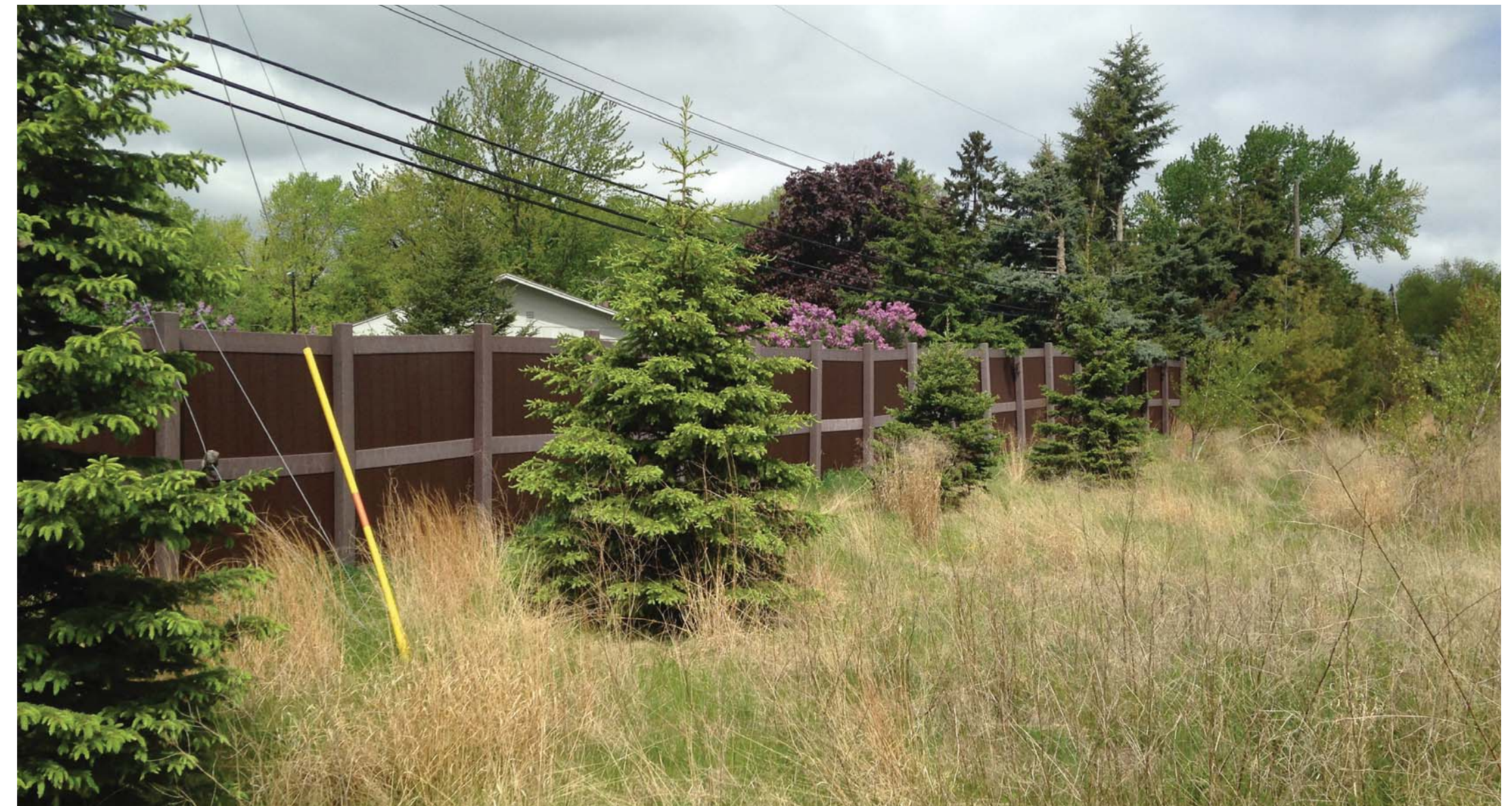
Existing composite fence at 63rd Avenue Park and Ride in Brooklyn Park