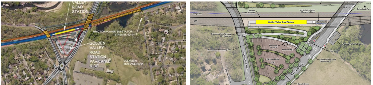
Left: 30 percent design aerial of the Golden Valley Road Station. Right: 60 percent design rendering of the Golden Valley Station with additional design details including landscaping.

Planting patterns for shrubbery, trees and turf, what station platforms and canopies will look like and the locations and heights of noise walls are among new design details available for public feedback at five open houses this month.