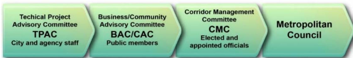
EXHIBIT ES-2 Southwest LRT Project Advisory Committee Process

The Council developed a Project website ( www.swlrt.org ), as part of the Council website. The Council’s Southwest LRT Project website serves as a communications forum and resource to the public, allowing stakeholders to keep informed about Project history, current activities and data, and upcoming milestones.