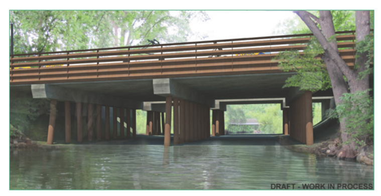
Above: Steel Pier bridge concept (artist's rendering).

Both the Arched Pier and Thin Deck concepts would be made of cast-in-place concrete.