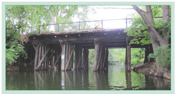
The existing wooden bridge (above) has six rows of wooden piers. Each side has different types of railing. View is looking west with the Burnham Road Bridge in the background.

Three bridge concepts for the Kenilworth channel crossing on the Southwest LRT (METRO Green Line Extension) would reinterpret the existing wooden railroad bridge with new low-profile structures.