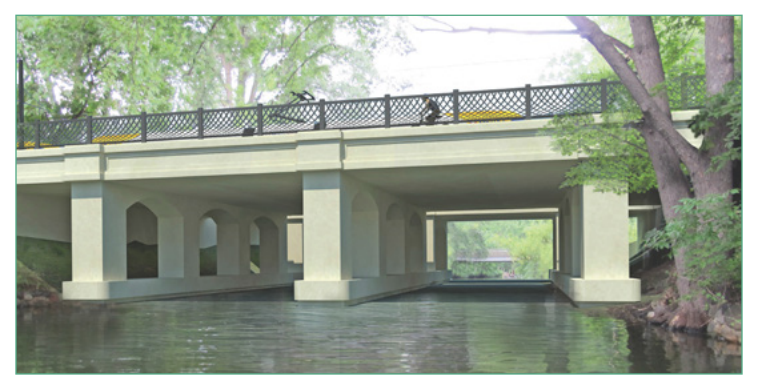
Above: Arched Pier bridge concept (artist's rendering).

The Thin Deck concept (center right) has angled concrete piers supporting a thin deck of concrete with light steel railings. The thin deck lessens the visual impact of the bridge over the channel. The concept would use charcoal-tinted concrete to reinterpret the existing wooden railroad bridge.