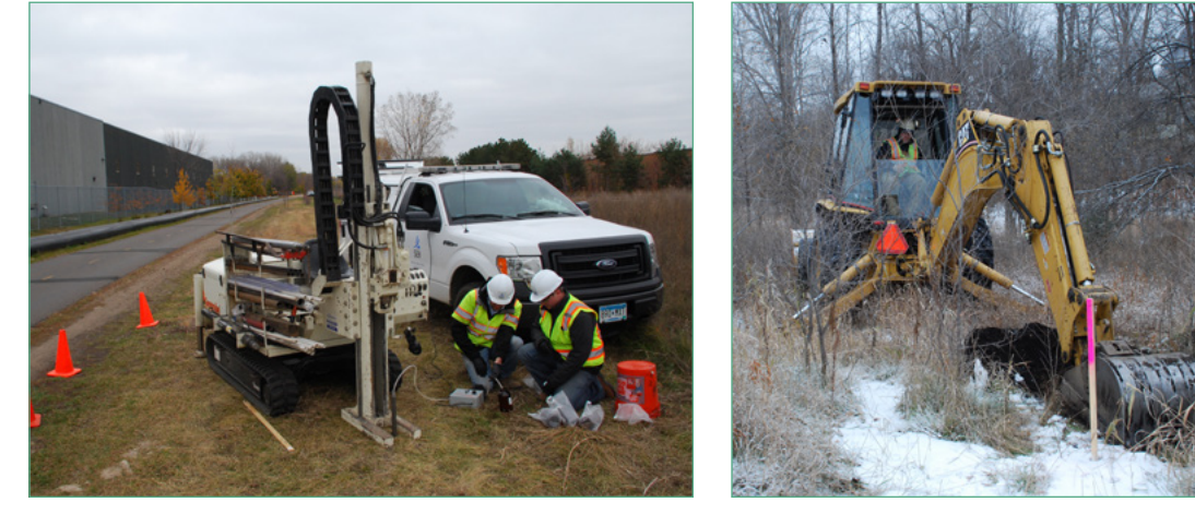
Above left: Crews conducted soil borings and took water samples in late October along the LRT alignment east of Highway 100 in St. Louis Park. Above right: In November, crews excavated test trenches.

This round of testing comes after work completed in 2013 and earlier in 2014, which found locations of likely contamination. Such sites typically include former railroad yards, gas stations and machine shops. The sites can also include former industrial properties, drycleaners and landfills.