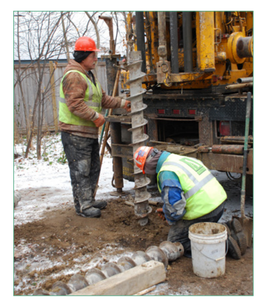
Above: Crews installed additional piezometers in the Kenilworth corridor to monitor ground water levels before LRT construction.

A landowner may be required by the MPCA to clean up contamination that presents a risk to human health or the environment.