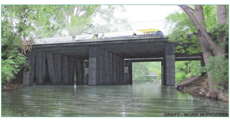
Above: Thin Deck bridge concept (artist's rendering).