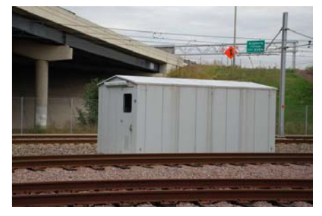
A typical signal bungalow is 10 feet wide by 16 feet long and 10 feet high.

Signal bungalows are small sheds that hold the equipment to operate and monitor the signals that regulate train movement on the alignment. Signal bungalows need to be placed near special trackwork, which refers to track features such as turnouts and crossing diamonds, to minimize installation costs and power demand and to reduce power losses.