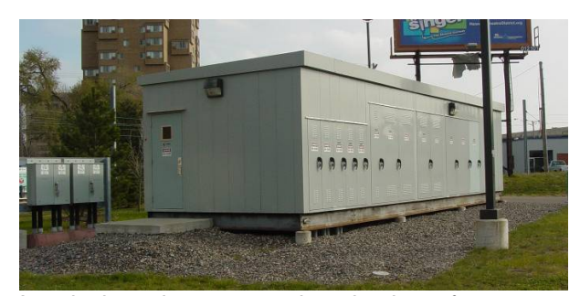
A typical traction power substation is 14 feet wide by 45 feet long and 11 feet high.

Traction power substations, which resemble intermodal containers carried on semitrailers, house electrical equipment used to change local utility power into power able to be transmitted to the overhead catenary system, a system of contact wires that supplies power to operate the trains. Substations have to be located close -- preferably within 500 feet of track -- to prevent power loss, rail-voltage rise and overhead contact strain and to contain cost.