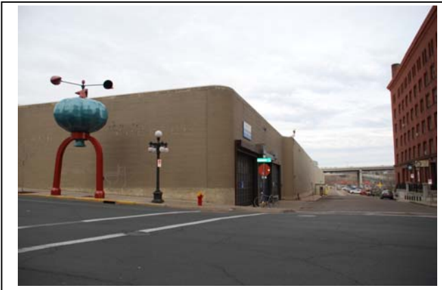
The vacant Diamond Products building located at Broadway and Prince streets in St. Paul's Lowertown.

The Ramsey County Regional Rail Authority conducted its own study and agreed that using the Diamond Products building would be better. The city of St. Paul and Ramsey County will consider the change shortly through the municipal consent process. The maintenance facility will bring 150 jobs to downtown St. Paul.