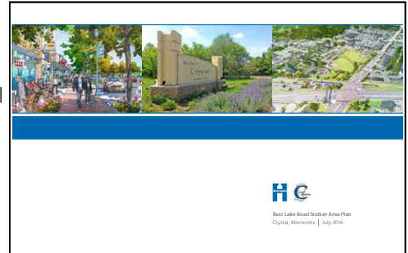
Bass Lake Road Station Area Plan (2016)

County Board adopted the route recommendation for the METRO Blue Line Extension. The new route for the Blue Line Extension will extend the existing Blue Line light rail transit from Target Field Station along West Broadway Avenue in Minneapolis to County Road 81 in Crystal and Robbinsdale, and along West Broadway Avenue in Brooklyn Park. In Crystal, the proposed route closely parallels the original route along Bottineau Boulevard. This Station Area Plan Update examines the revised route for the Bass Lake Road Station in the City of Crystal, evaluating existing conditions and making recommendations within a half-mile of the proposed station.