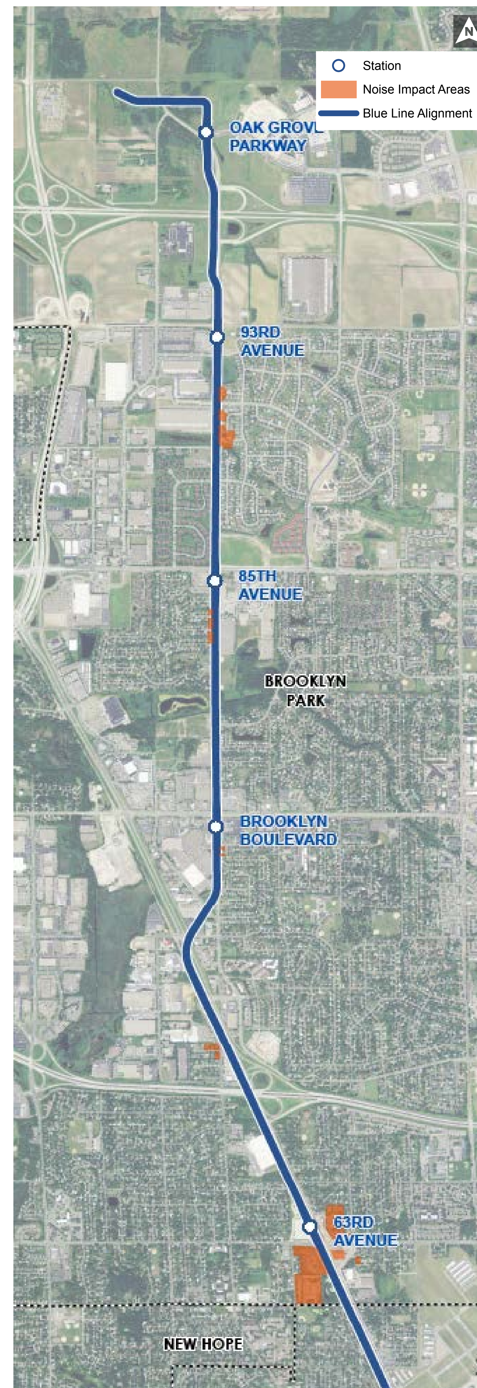
Without Quiet Zones