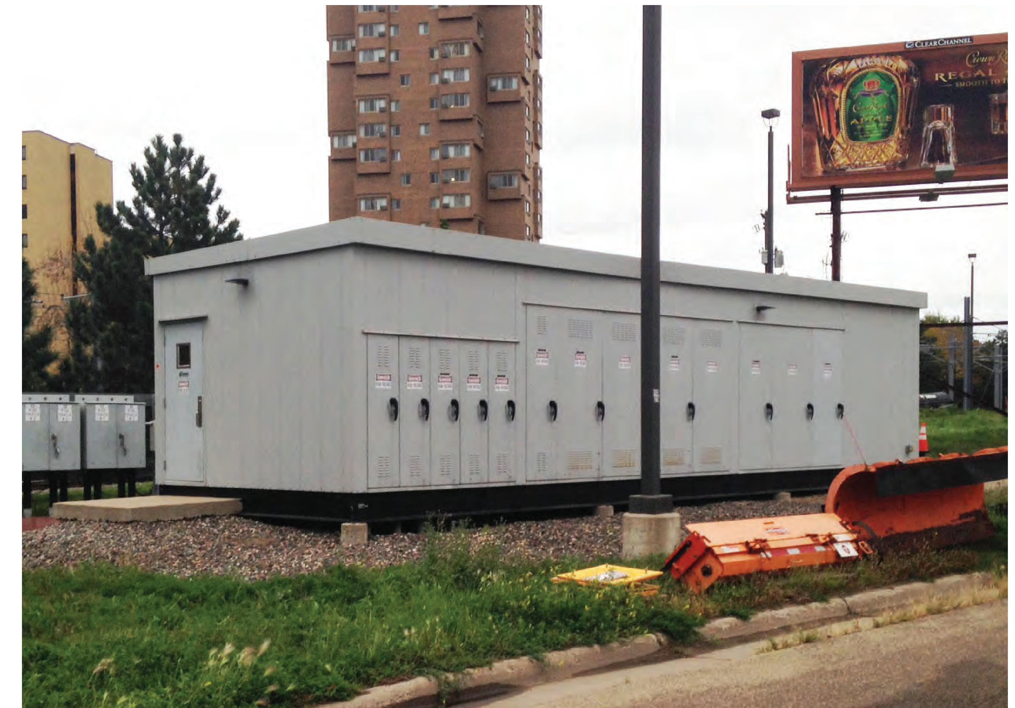
Existing TPSS along the Blue Line