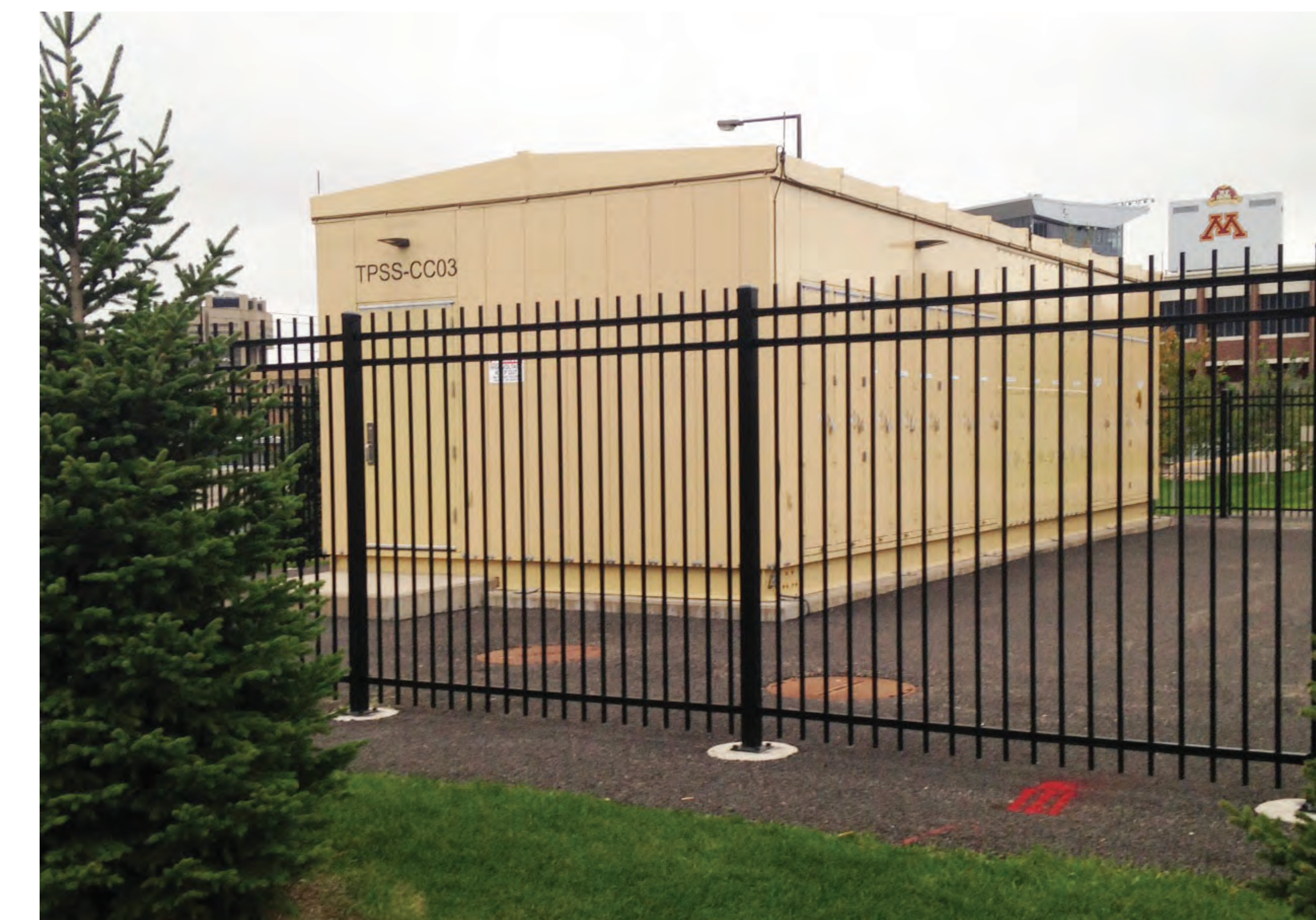
Existing TPSS along the Green Line