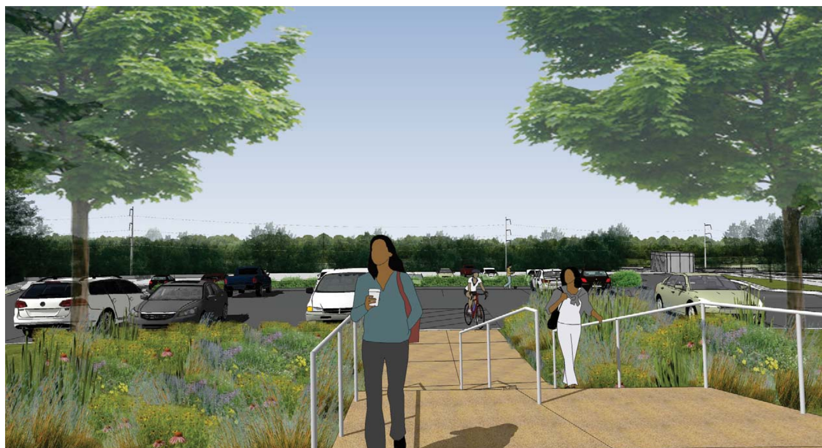
Concept view of park and ride from Theodore Wirth Pkwy and Golden Valley Rd