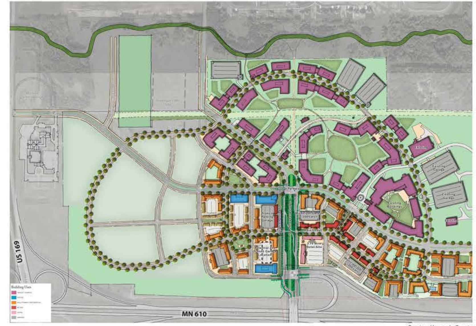
Oak Grove Parkway area planning concept plan