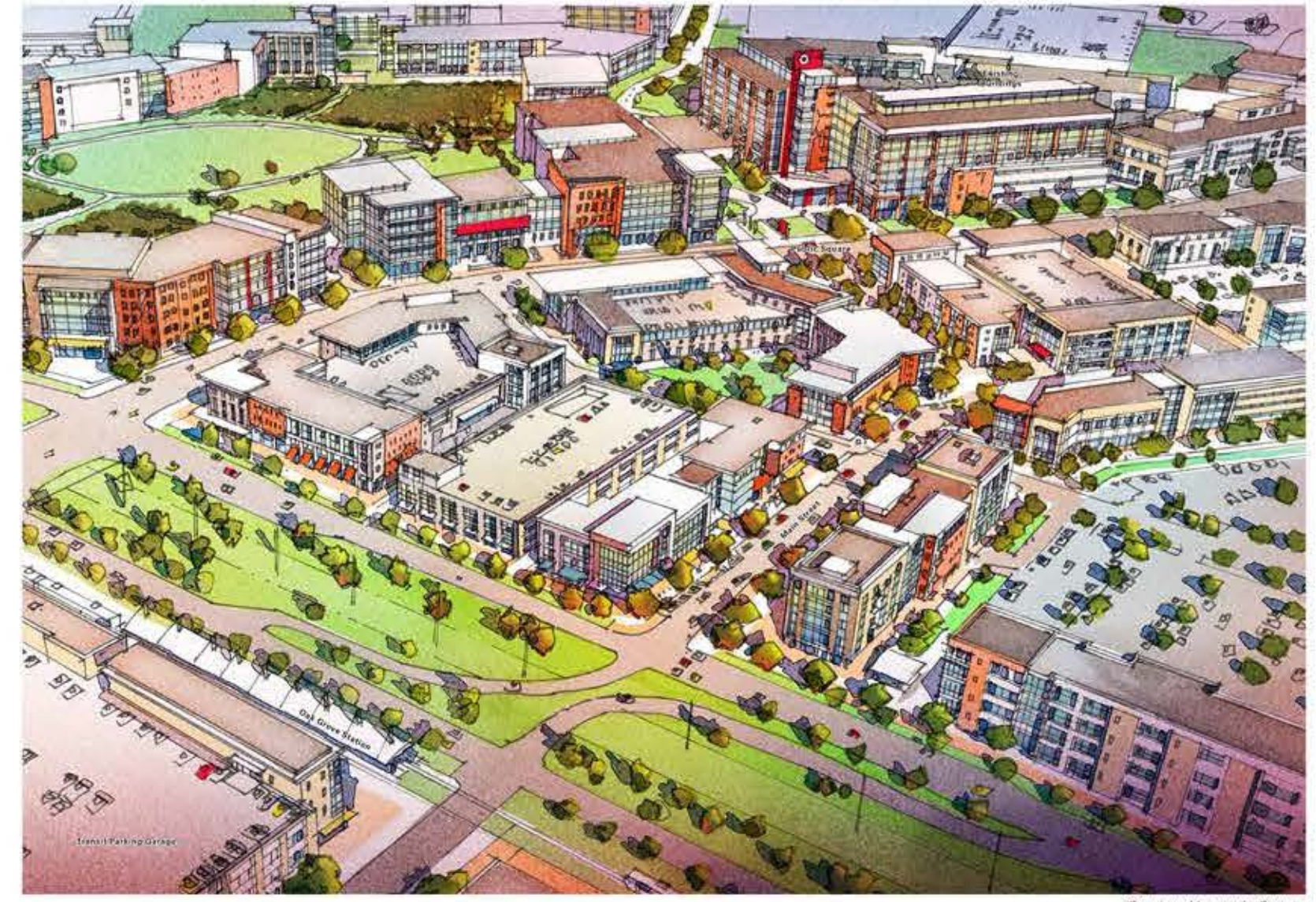
Oak Grove Parkway area planning concept sketch