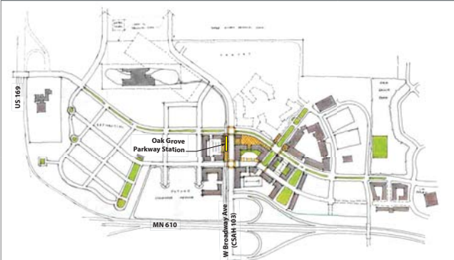
Oak Grove Parkway Station Area - Concept 2