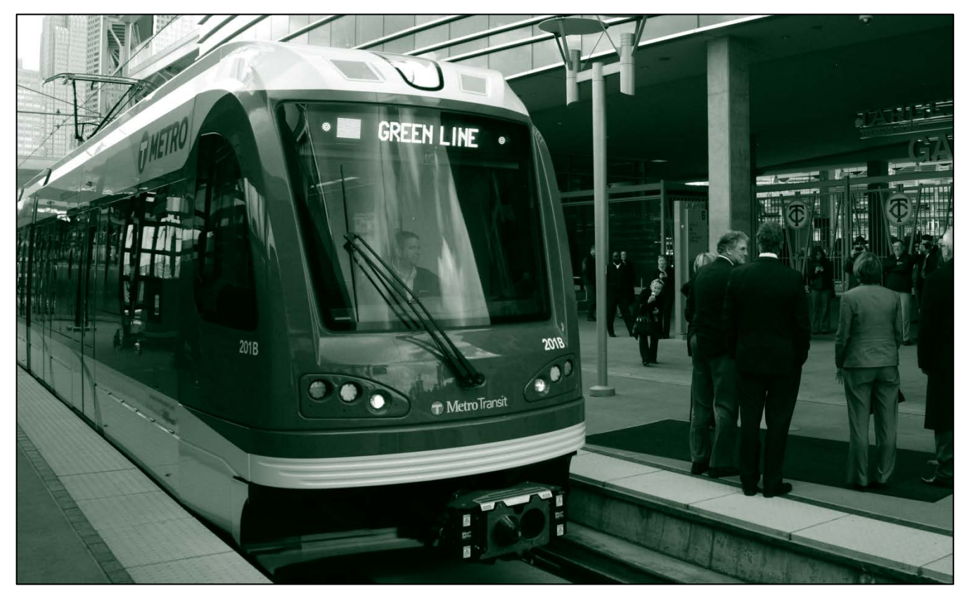
Southwest LRT EMI/EMF and Utility Impacts Supporting Information

May 2016 Southwest LRT Project Technical Memorandum