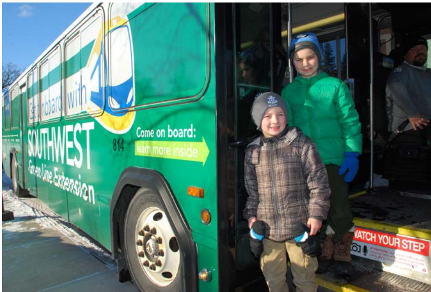
Southwest LRT Project mobile office, which brings Project information to the community.

Additionally, a variety of Project-specific print material were developed for this Project, including a project one-pager and fact sheets (e.g., relating to noise and vibration), frequently asked questions, and the Field Guide to LRT Elements . These materials were provided at project meetings and open houses.