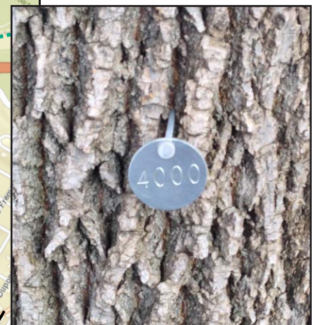
Above: Example of tree identification tag.