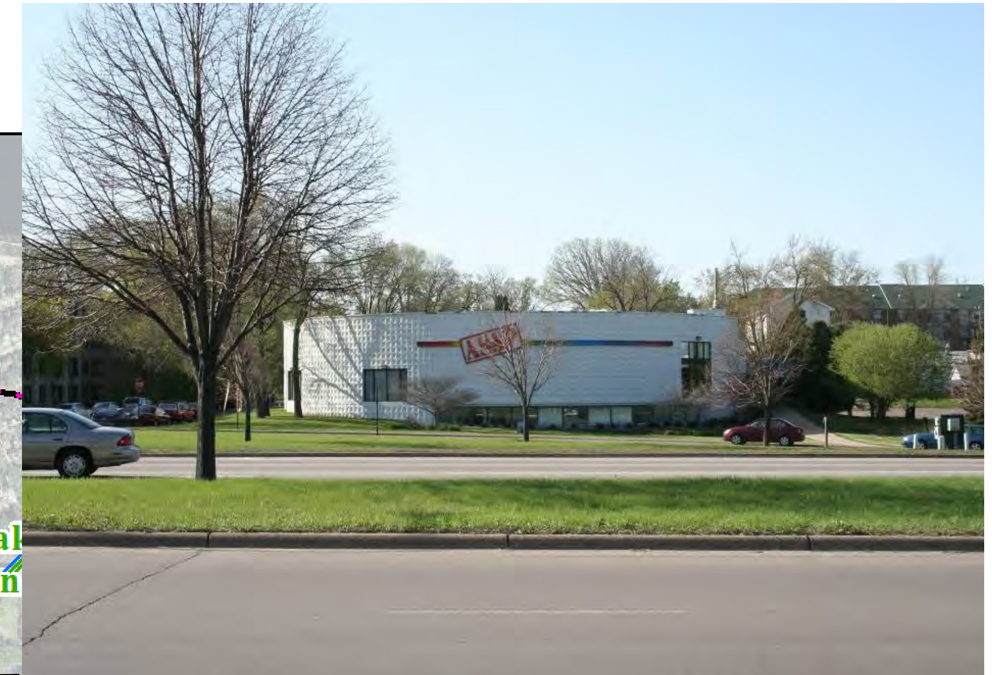
Hoffman Callan Building 3907 Hwy. 7 NRHP Status: Eligible Criterion: C Area of Significance: • Architecture