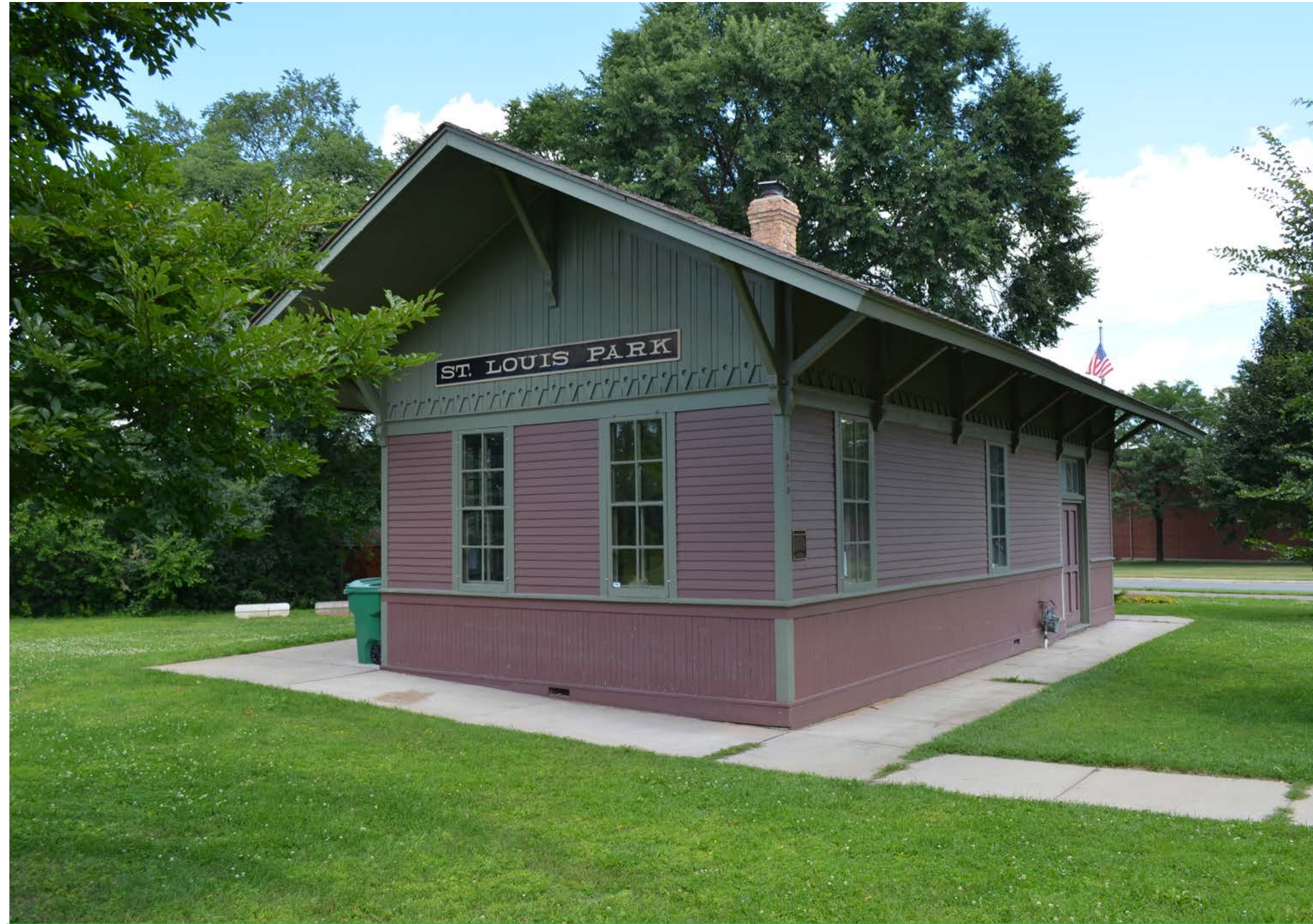
Chicago Milwaukee & St. Paul RR Depot 6210 W. 37th St NRHP Status: Listed Criterion: A Area of Significance: • Transportation