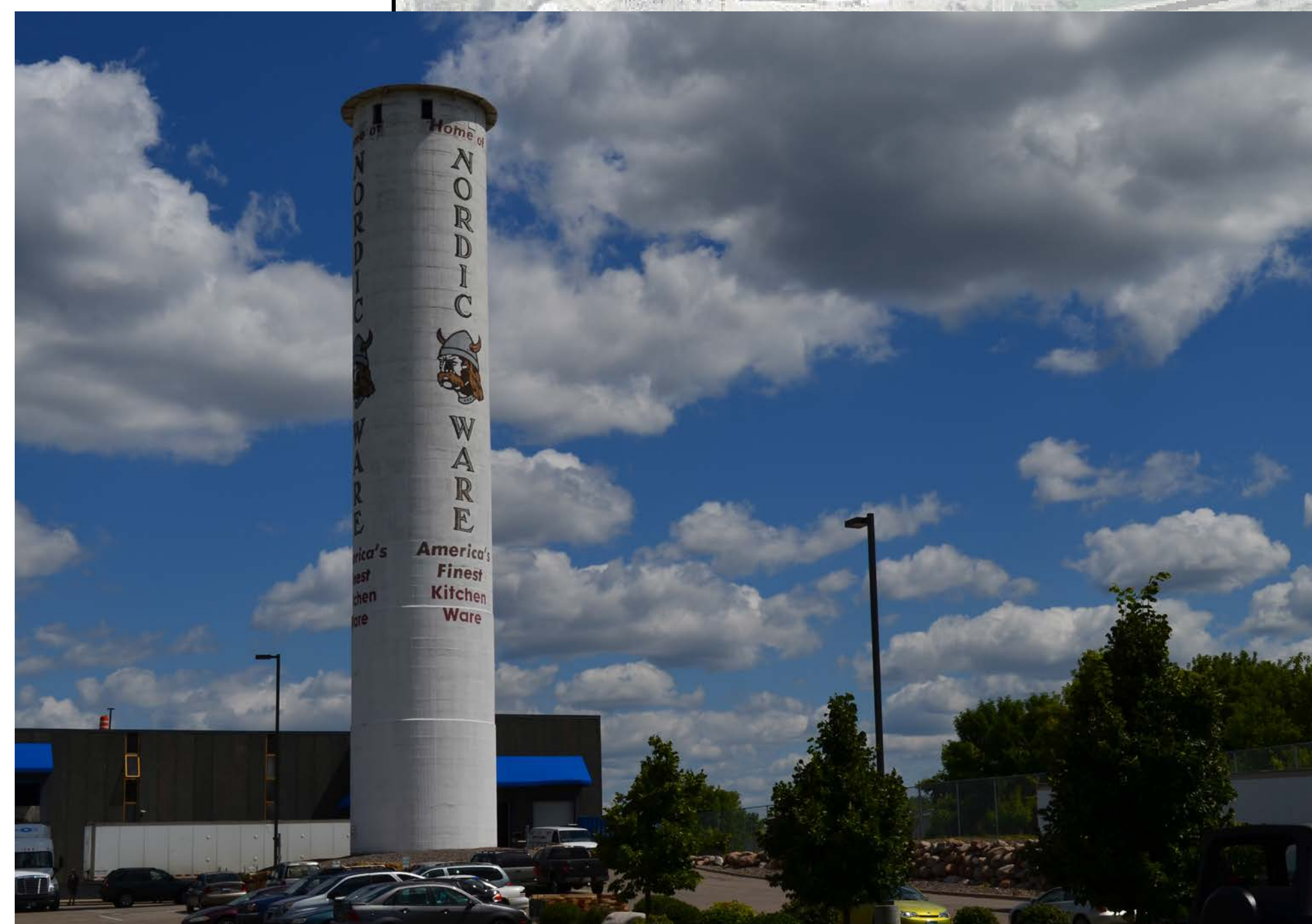
Peavey-Haglin Experimental Concrete Grain Elevator Hwys. 100 and 25 NRHP Status: Listed, also a National Historic Landmark Criterion: C Area of Significance: • Economics • Engineering