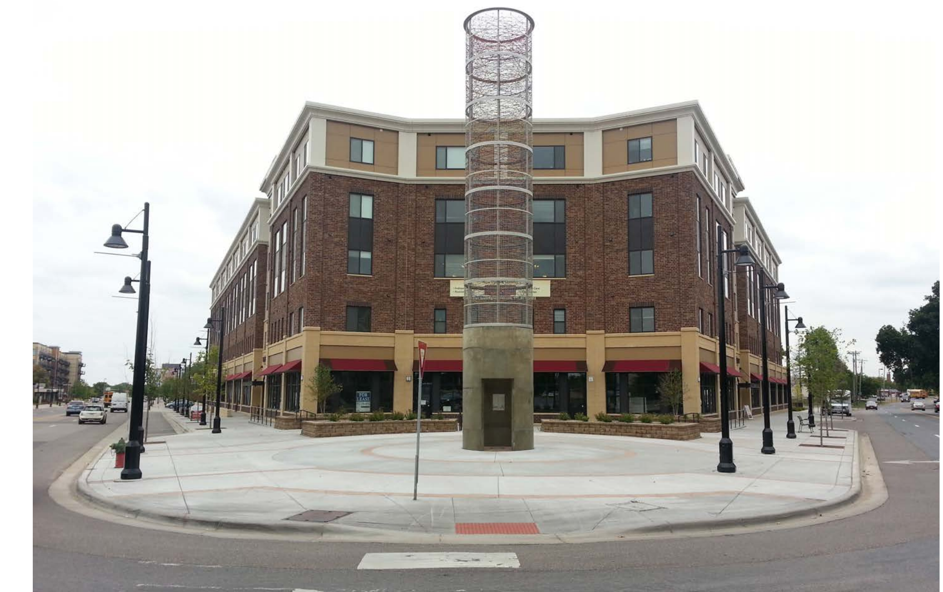
Nearby apartment complex at the corner of Wooddale Avenue South and West 36th Street.