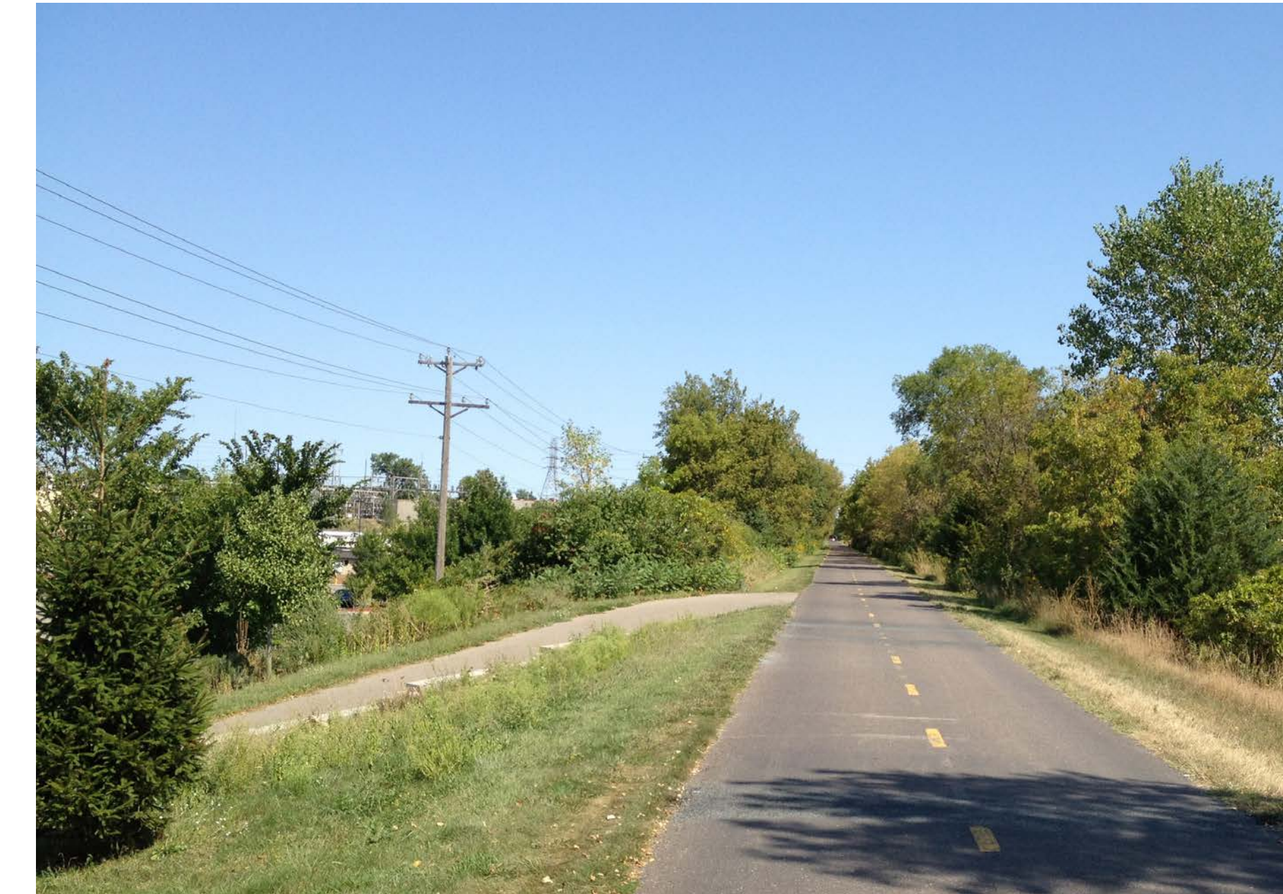
Cedar Lake Trail looking east near station site.