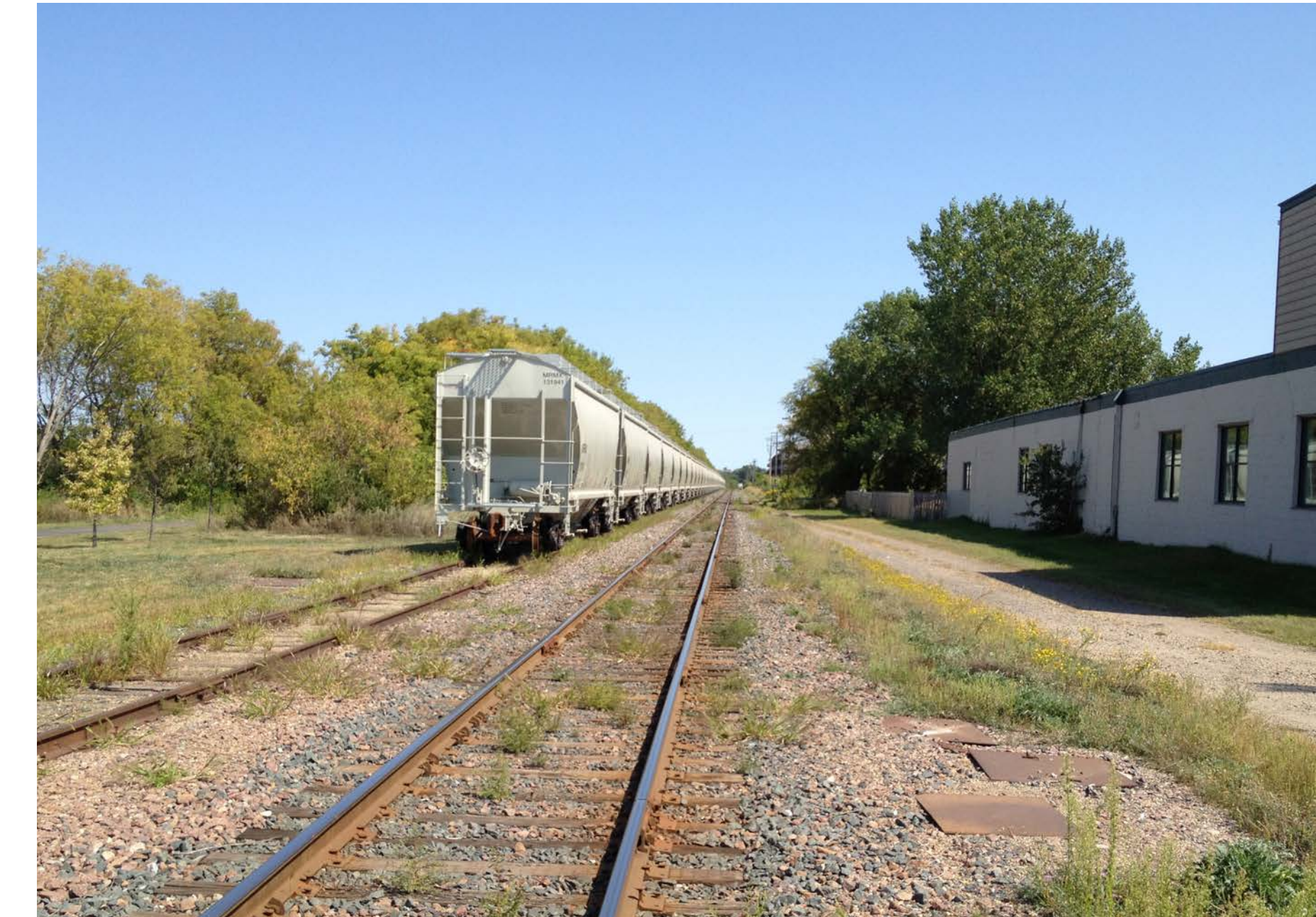
Wooddale Avenue South looking east toward the station site.