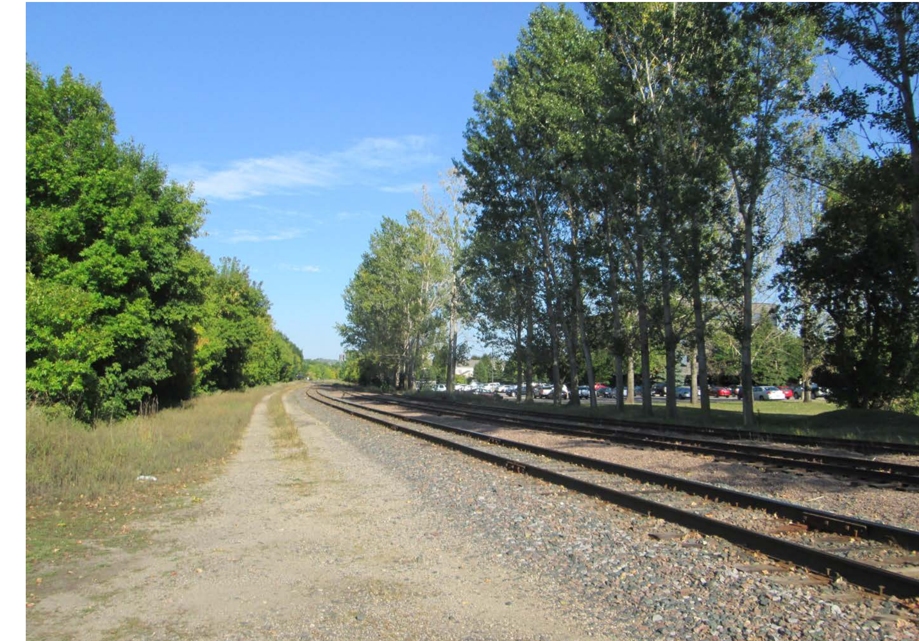
Near Beltline Boulevard looking east toward the station site.