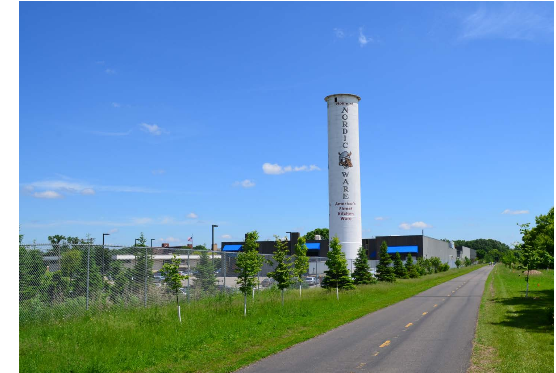
Cedar Lake Trail looking east toward Nordic Ware.