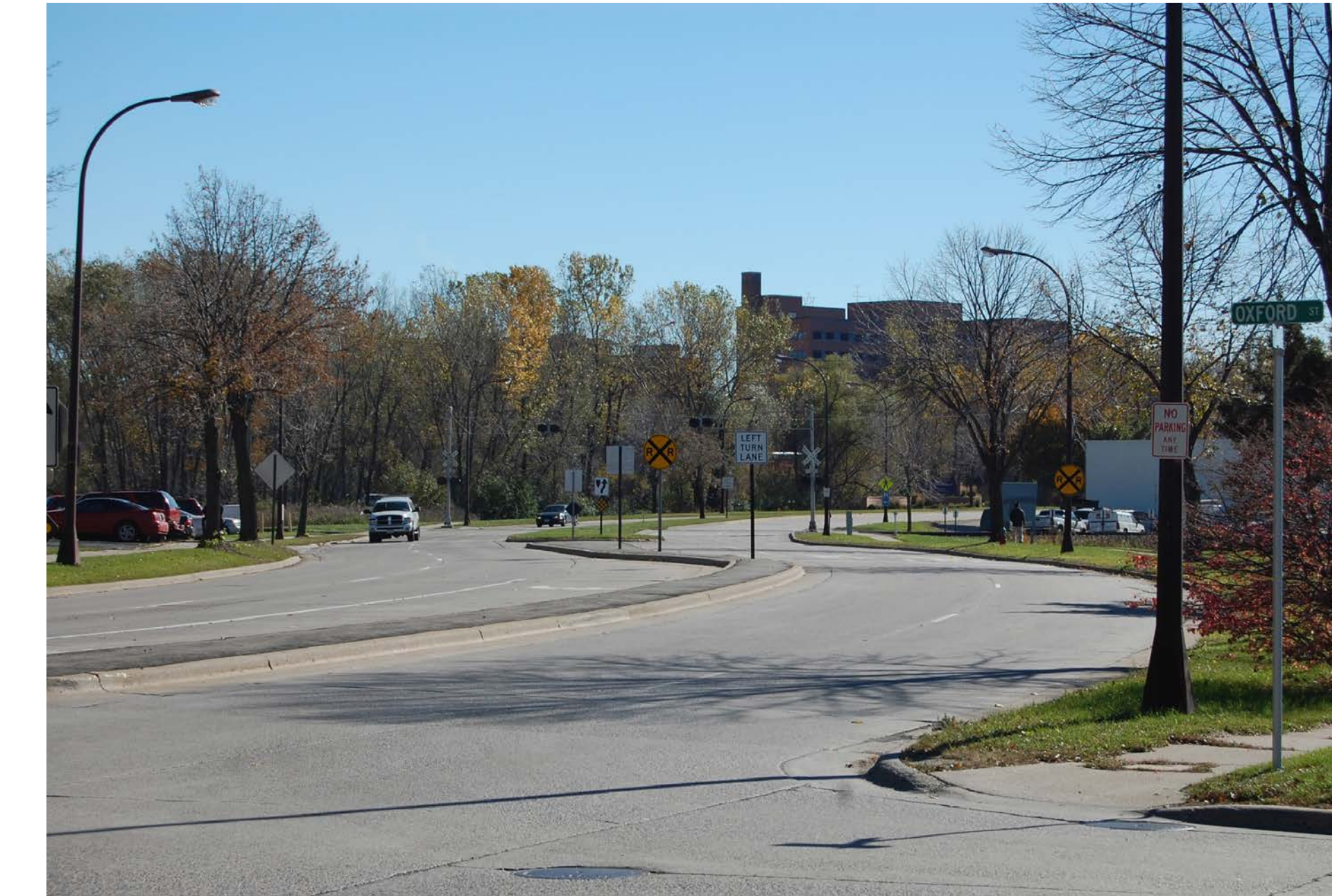
Looking south at Louisiana Avenue and Oxford Street to Park Nicollet Methodist Hospital.