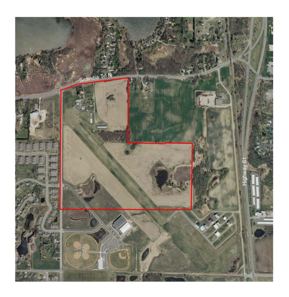
Figure 9-8: Forest Lake Airport