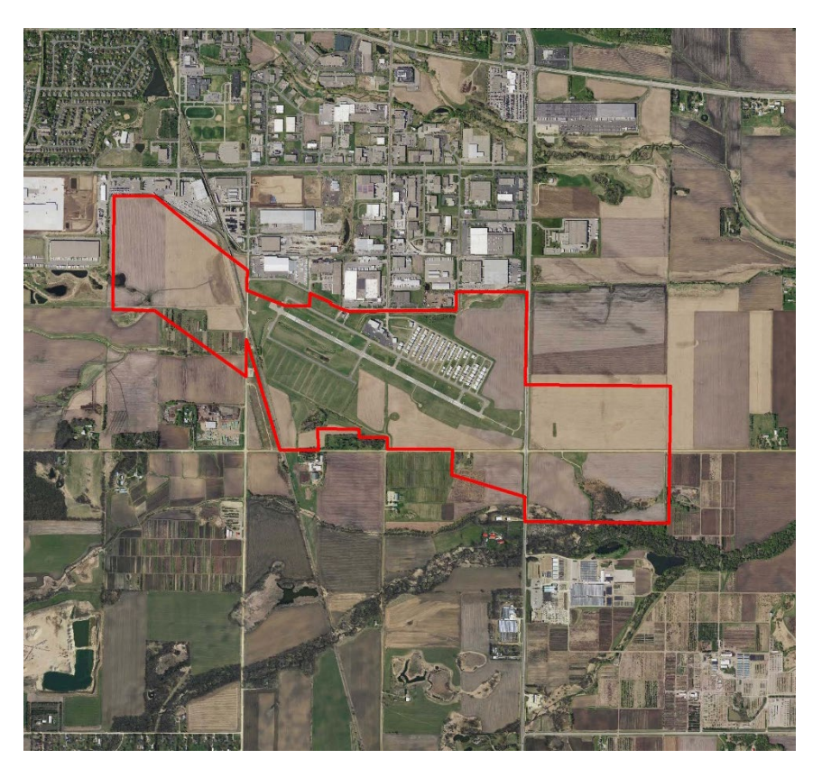
Figure 9-4: Airlake Airport