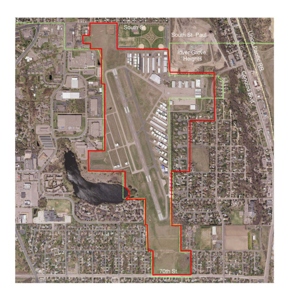
Figure 9-10: South St. Paul Airport