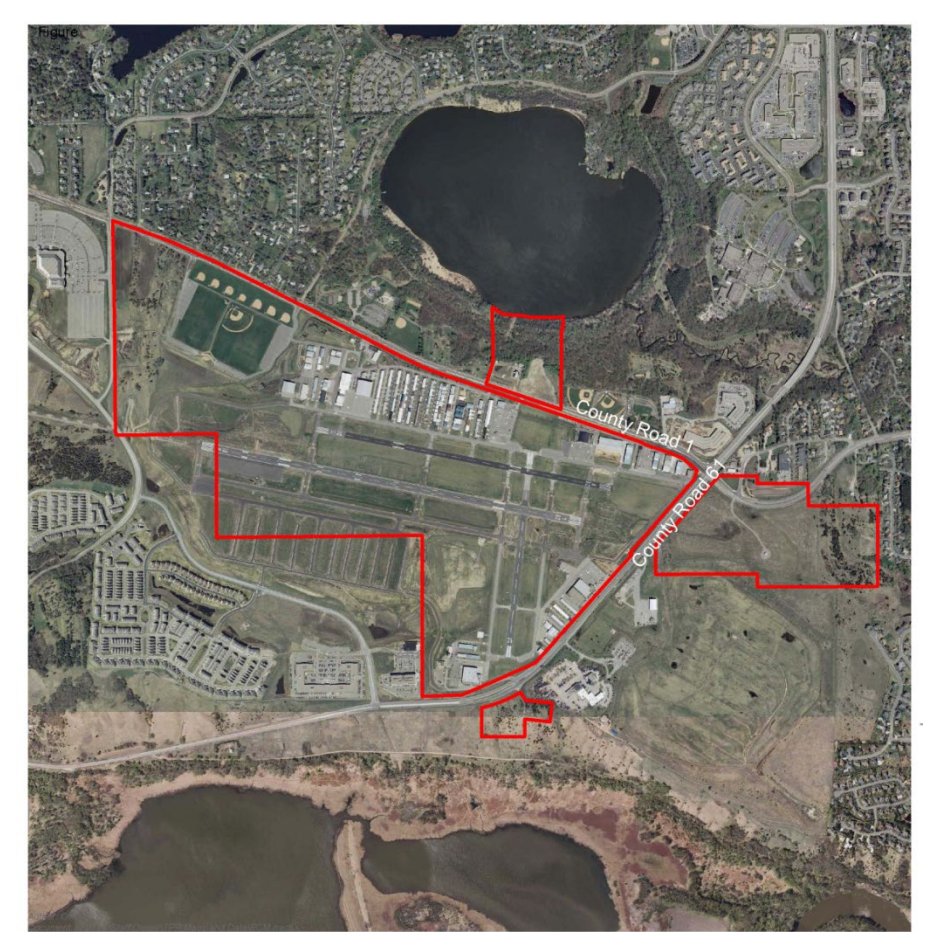
Figure 9-7: Flying Cloud Airport