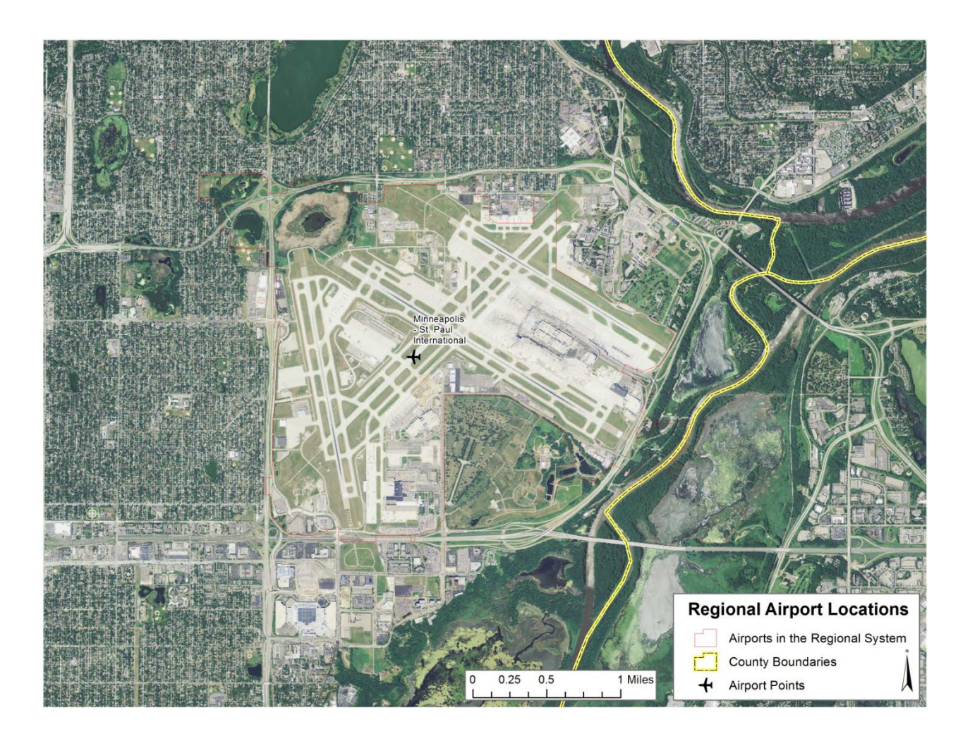
Figure 9-2: Minneapolis-Saint Paul International Airport