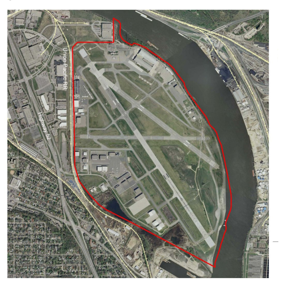
Figure 9-3: Downtown St. Paul Airfield