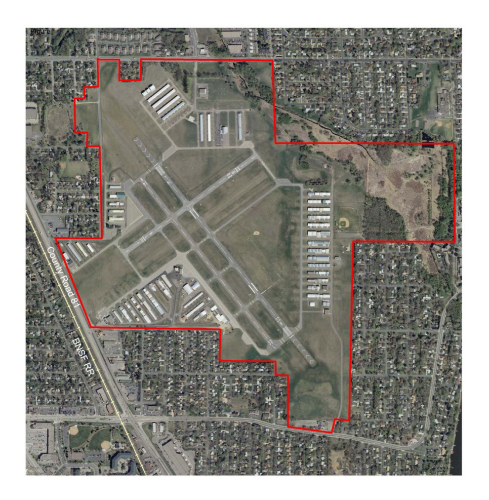
Figure 9-6: Crystal Airport