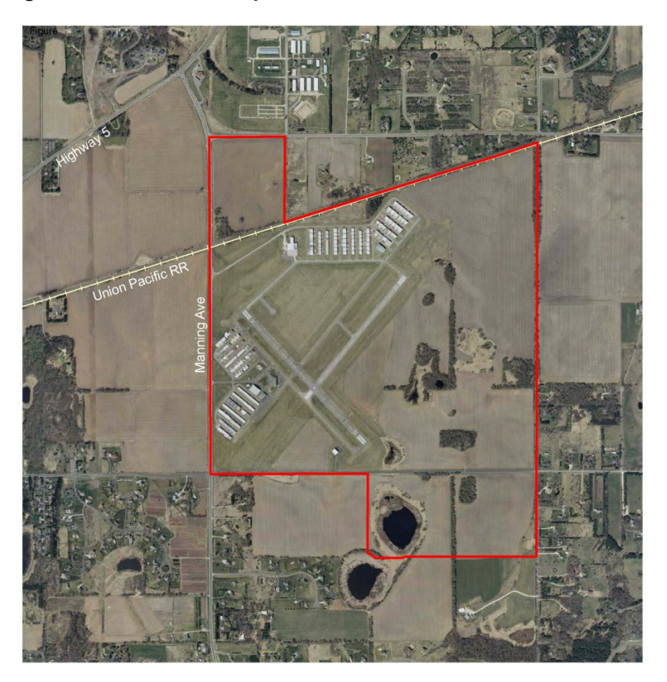
Figure 9-9: Lake Elmo Airport