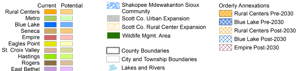
Figure 2: Long term service areas of the Twin Cities metropolitan area