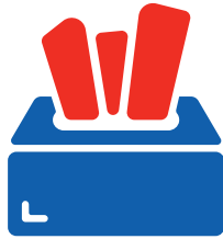
Tissues & Napkins