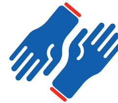
Disposable Rubber Gloves