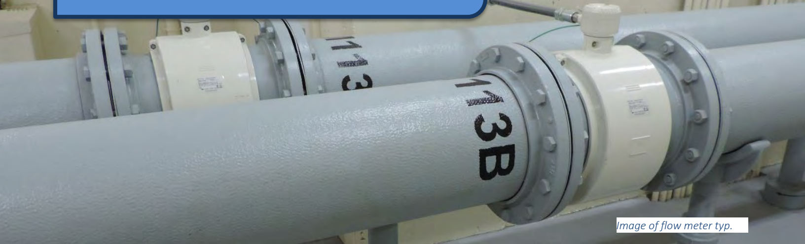
Image of flow meter typ.