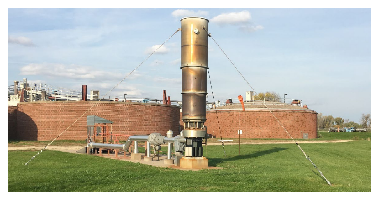
Biogas flare and Digesters 4 and 5 at Empire WWTP

Project location: Council district #16, Empire Township, Empire WWTP