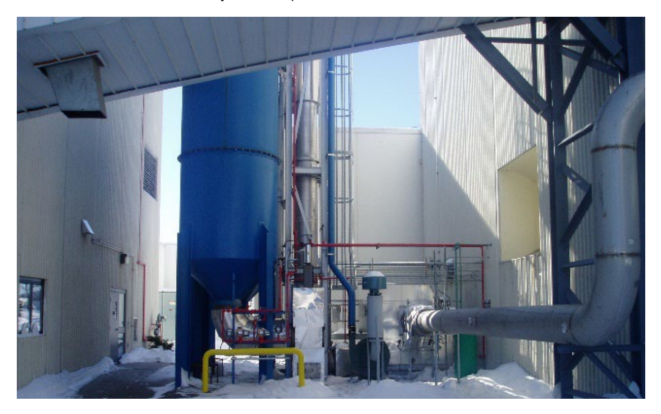
Existing Regenerative Thermal Oxidizer

Project location: Council district #4, City of Shakopee, Blue Lake WWTP