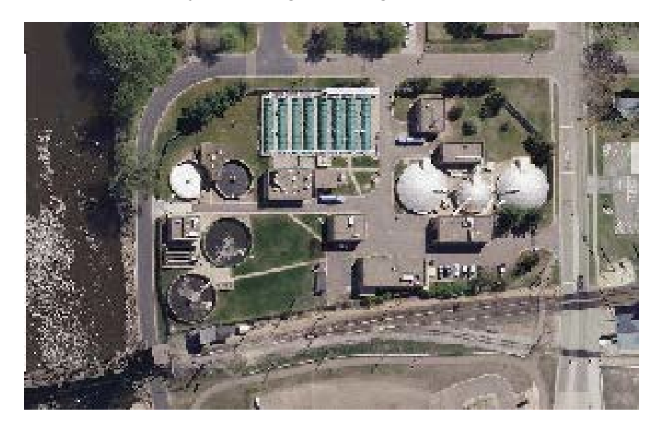
Aerial View of Hastings WWTP

Project location: Council district #12, City of Hastings, Hastings WWTP