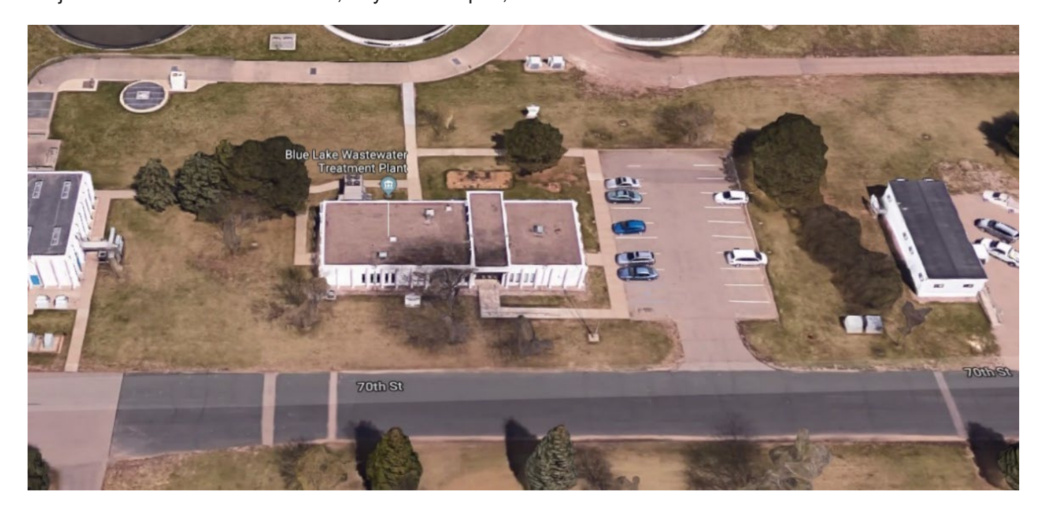
Blue Lake WWWTP Administration Building

Project location: Council district #4, City of Shakopee, Blue Lake WWTP