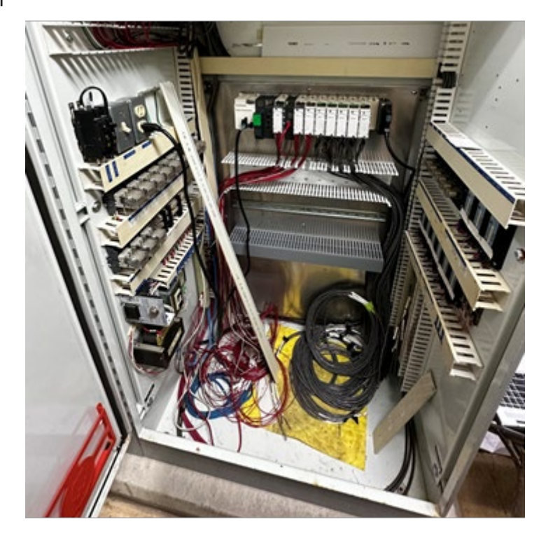
Typical PLC (Programmable Logic Controller)