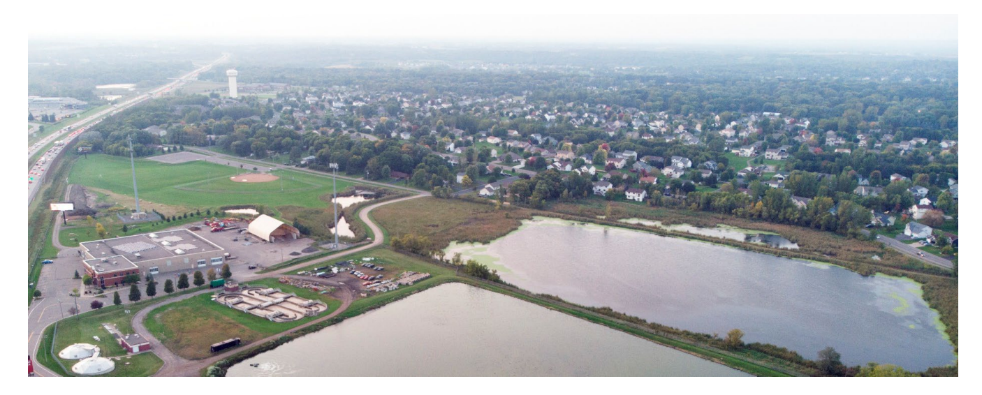
Aerial view of the Rogers Wastewater Treatment Facility acquired by ES in 2018