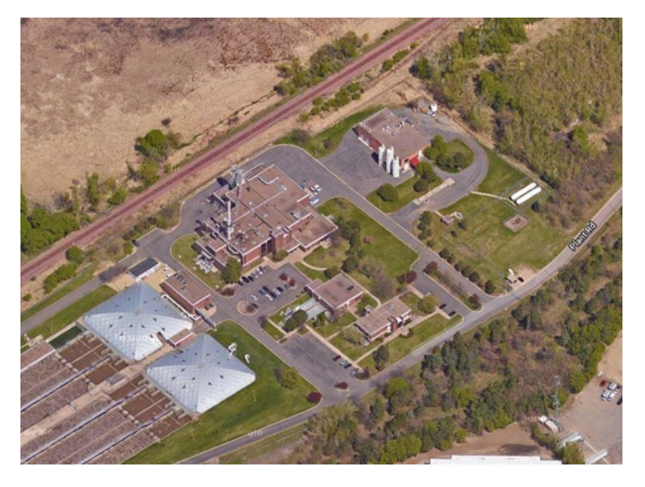
Aerial View of Seneca WWTP

Project location: Council district #15, City of Eagan, Seneca WWTP