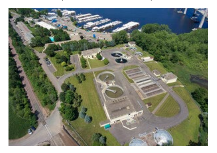
Aerial photo of St. Croix Valley WWTP

Project location: Council district #11, City of Stillwater, St. Croix Valley WWTP