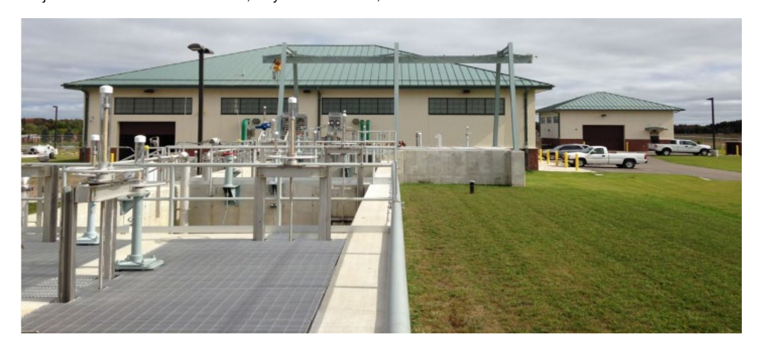
East Bethel Water Reclamation Plant

Project location: Council district #9, City of East Bethel, East Bethel WWTP