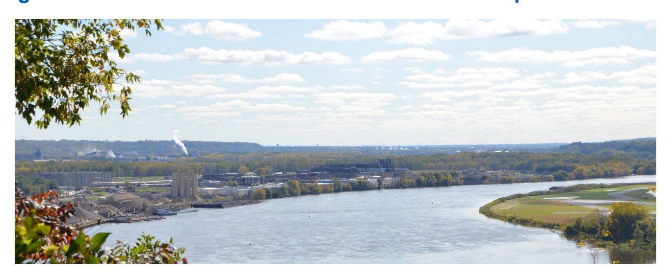
View of Metropolitan Wastewater Treatment Plant (WWTP)