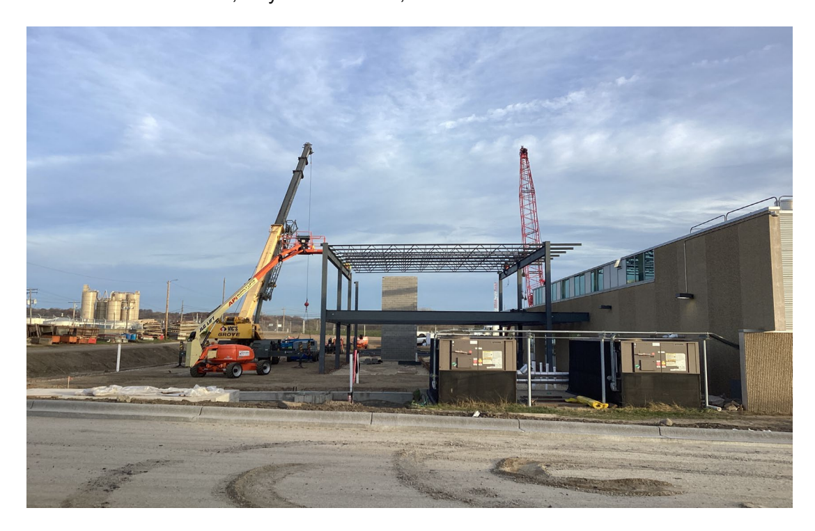
Framing the western section of the Services Building

Project location: Council district #13, City of Saint Paul, Metro WWTP