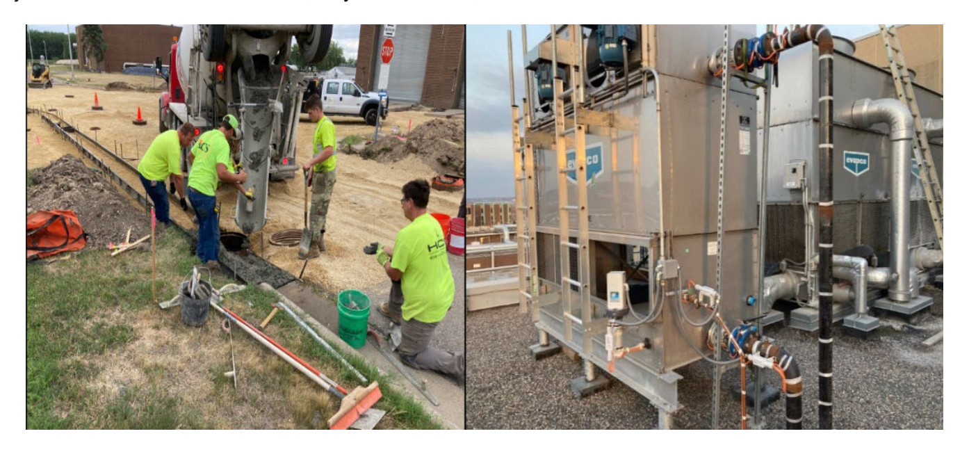
Left: 5th and 5th Road Rehabilitation; Right: Closed-loop cooling system at SMB

Project location: Council district #13, City of Saint Paul, Metro WWTP