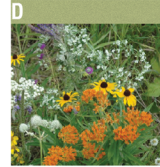
Short grass prairie