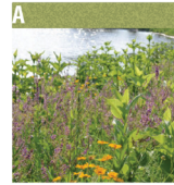
Native stormwater prairie