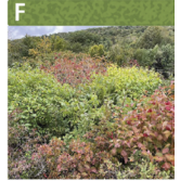
Native trees and shrubs