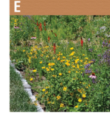
Wildflower rain garden