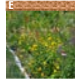
Wildflower rain garden