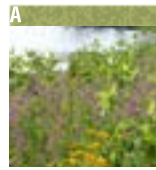
Native stormwater prairie