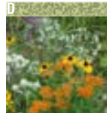
Short grass prairie