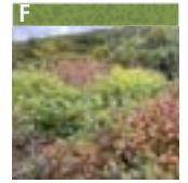
Native trees and shrubs