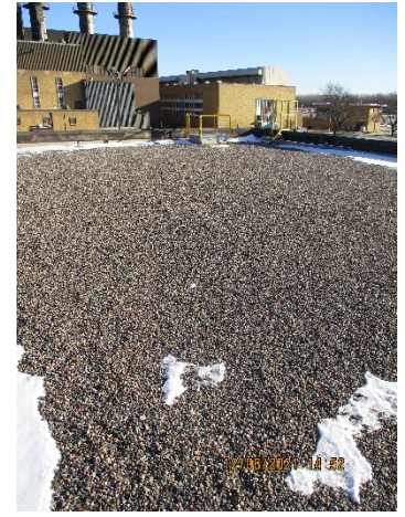
Pump and Blower Roof Complete