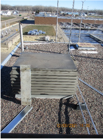
CL2 Lower Roof Complete with Exception of HVAC Improvements