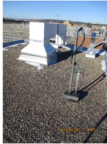
WSE3 Roof Complete