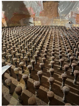
New FBI2 Air Distribution System