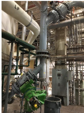
New FBI2 Cake Pump Valve