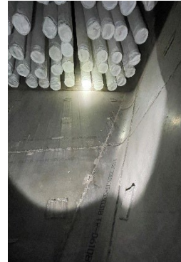
New BH2 Stainless Steel Liner