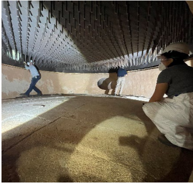
FBI2 Windbox Inspection