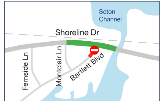
Map showing Bartlett Blvd. closure at the Shoreline Drive intersection.

Drivers should use alternate routes to access Shoreline Drive. The closure is expected to last from 7 a.m. to 7 p.m.