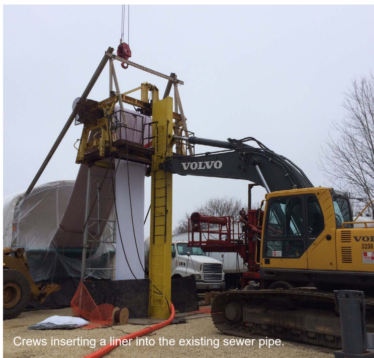
Crews inserting a liner into the existing sewer pipe.