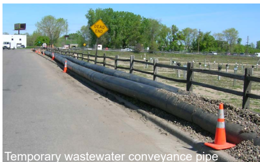
Temporary wastewater conveyance pipe

Work will include removing and replacing part of the sewer pipe near County Rd. D and lining part of the sewer pipe near Brenner Ave. Construction crews will also replace a manhole and meter station at the intersection of Avon St. and County Rd. D. A temporary wastewater conveyance pipe will be set up along the west side of Avon St. The pipe will be used to transfer wastewater during construction.