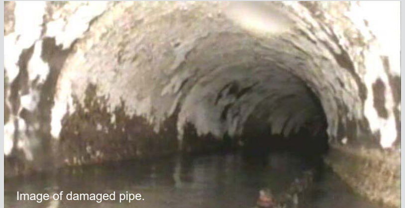
Image of damaged pipe.

A substantial amount of the sewer system in the metro area was last updated in the 1960s and 1970s. Since then, pipes have deteriorated and need to be repaired or replaced. MCES has responded by developing a long-term plan in collaboration with local government to rehabilitate sections of sewer pipe, beginning in areas of critical need.