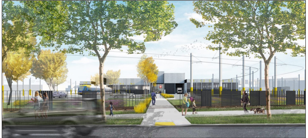
Above: Rendering shows what passersby will see once construction, fencing and landscaping is complete for the operations and maintenance facility for the indoor maintenance, cleaning and storage of up to 30 light rail vehicles.

Crews will also improve the soil on the site, construct track outside the building for moving trains to and from the main line, and build access roads and systemwide electrical cable trough/ductbank/foundations, and install utilities, drainage and landscaping.