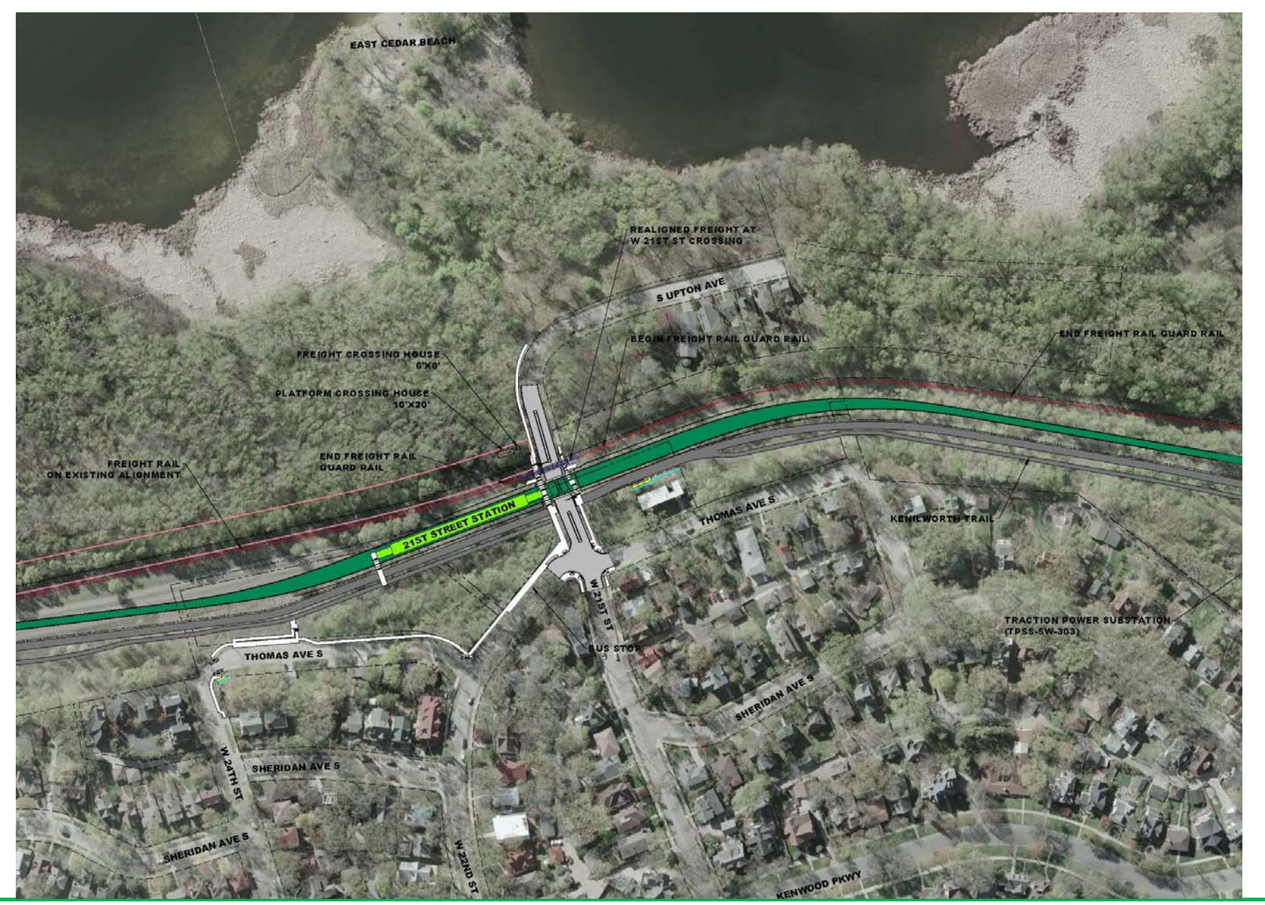
Figure 1 – 21<sup>st</sup> Street Station-Preliminary Engineering Plan