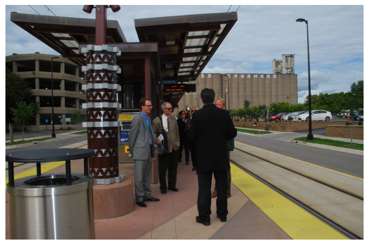
Prospect Park Station on the METRO Green Line (top) is an example of the center-platform design. A single platform (above) serves trains traveling in both directions.

There are also unique benefits to individual stations. For example, at West Broadway and 85th Avenue, engineers are proposing a center-platform station on the south side of the intersection nearest North Hennepin Community and Technical College. This would minimize noise impacts to residents in the Maplebrook townhomes on the north side of the intersection by providing more distance between the station and the homes but still providing convenient access to the station at the intersection.