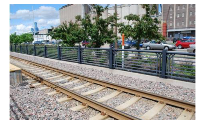
Safety railings near stations prevent pedestrians from walking onto the light rail tracks.

A center-platform station on the METRO Blue Line. Bus stops at stations connect light rail passengers with the metropolitan bus network.