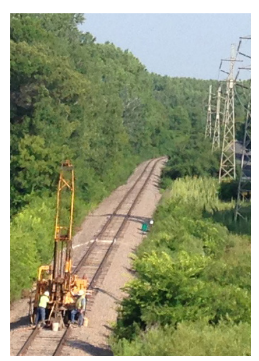
A testing crew takes a soil boring along freight rail tracks near Golden Valley Road.

The project office is being proactive in reviewing what is in the Draft Environmental Impact Statement (DEIS) cost estimate and advising project partners