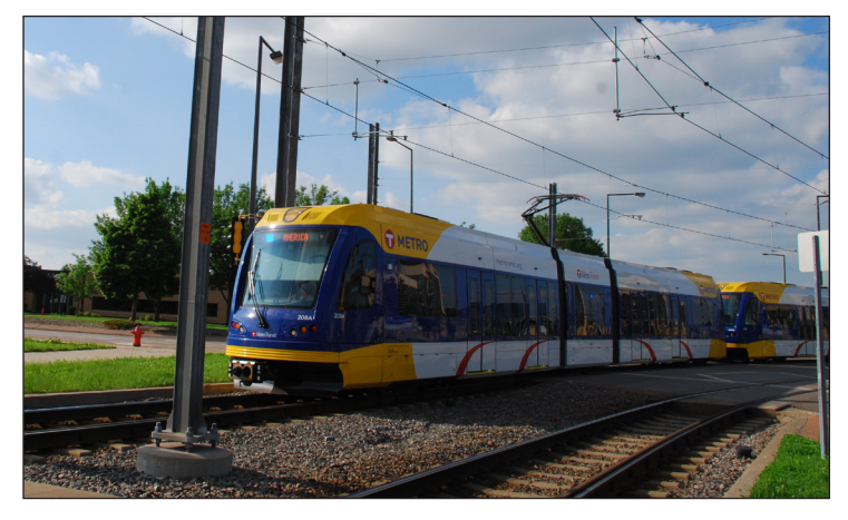
Light rail trains, like the METRO Green Line train on the left above, are smaller than commuter rail trains and offer more frequent service. They operate on dedicated light rail tracks, which may be located along streets or in the center of streets in urban areas.