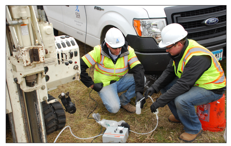
Environmental technicians are testing soil along the Blue Line Extension route for possible contamination.

The project office is actively working to minimize these risks by conducting environmental/soil testing (which is over half complete), advancing its engineering work on the project and coordinating with project partners.