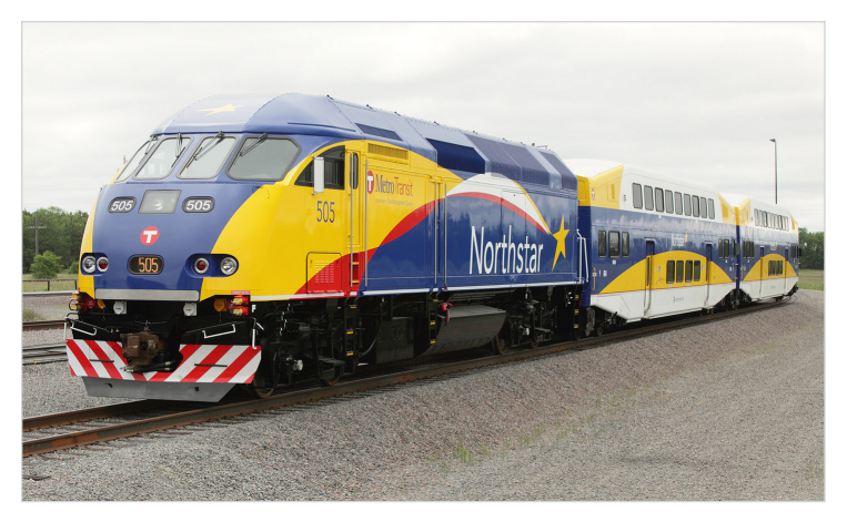
Northstar commuter rail trains, like the one shown on the right above, are pulled by large diesel-electric locomotives and operate over longer distances with fewer stops. Commuter rail trains share track with freight rail service.