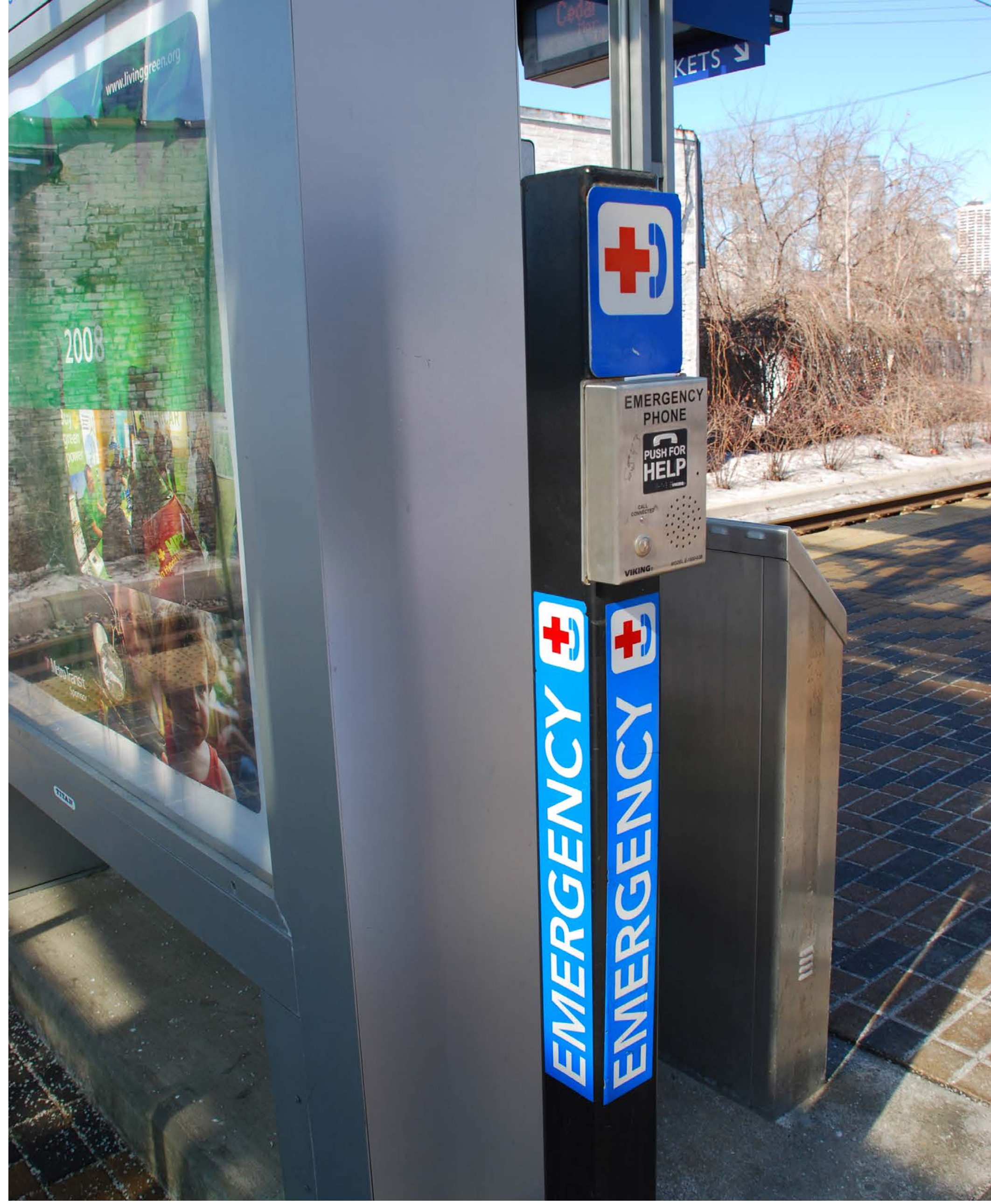
Security cameras and emergency phones are located on station platforms.