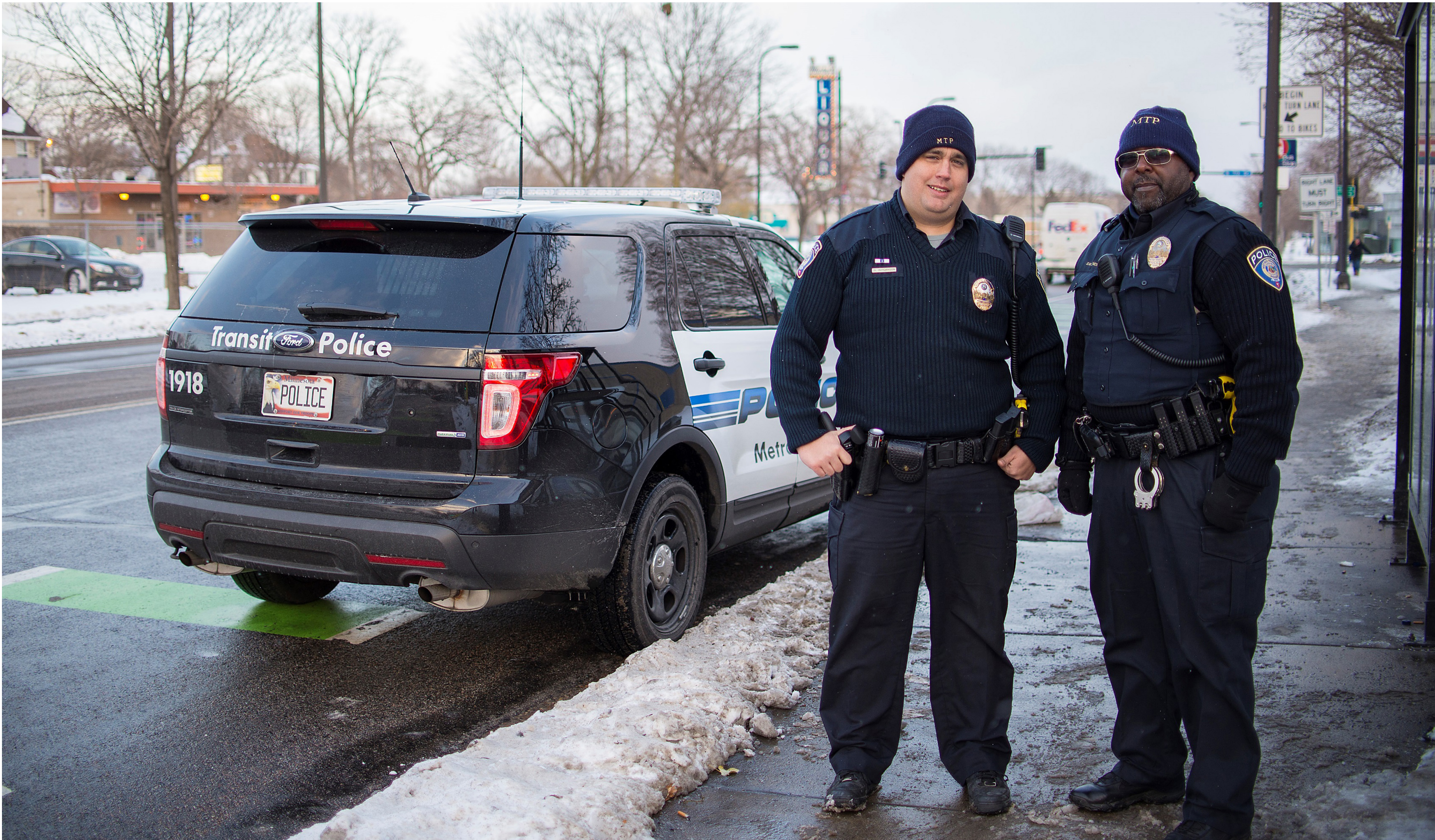
Metro Transit police officers ride buses and trains as well as patrol along transit routes.