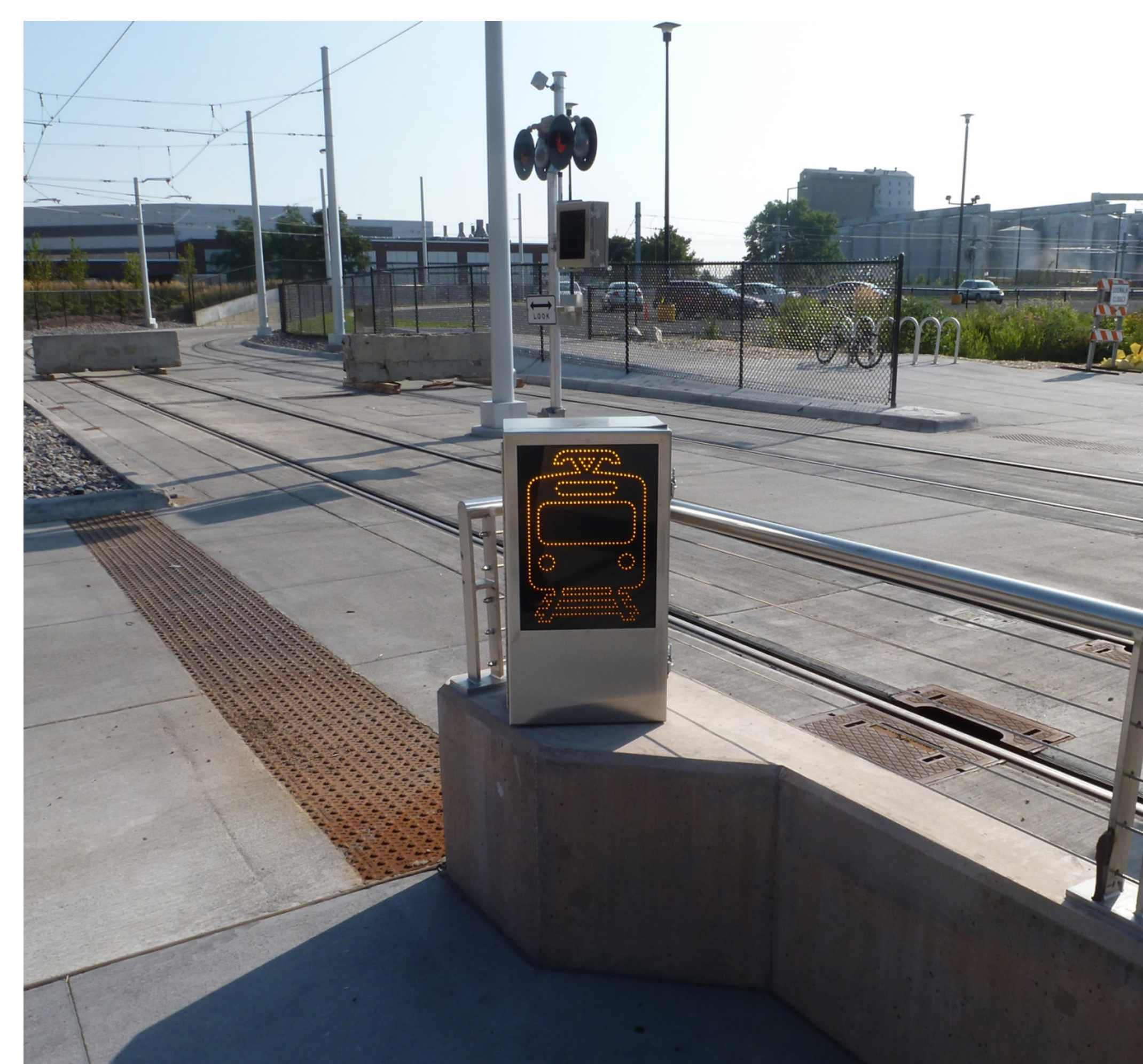
Warning devices alert pedestrian to approaching trains, and signs instruct people to look both ways before crossing tracks.