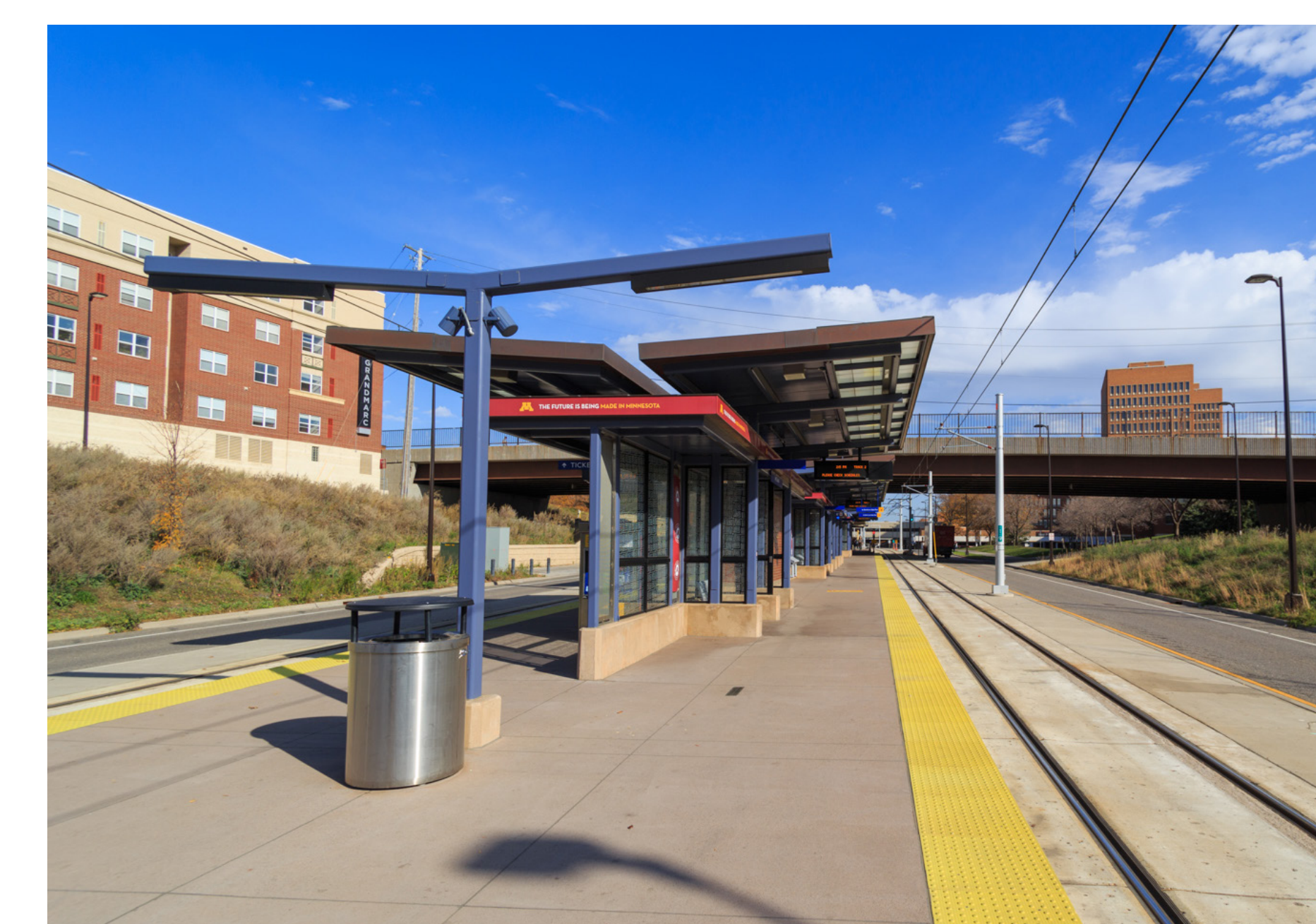
Example of center platform West Bank Station, METRO Green Line