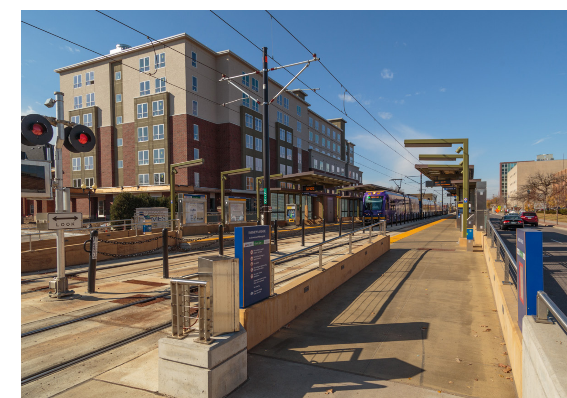
Example of side platform Fairview Station, METRO Green Line