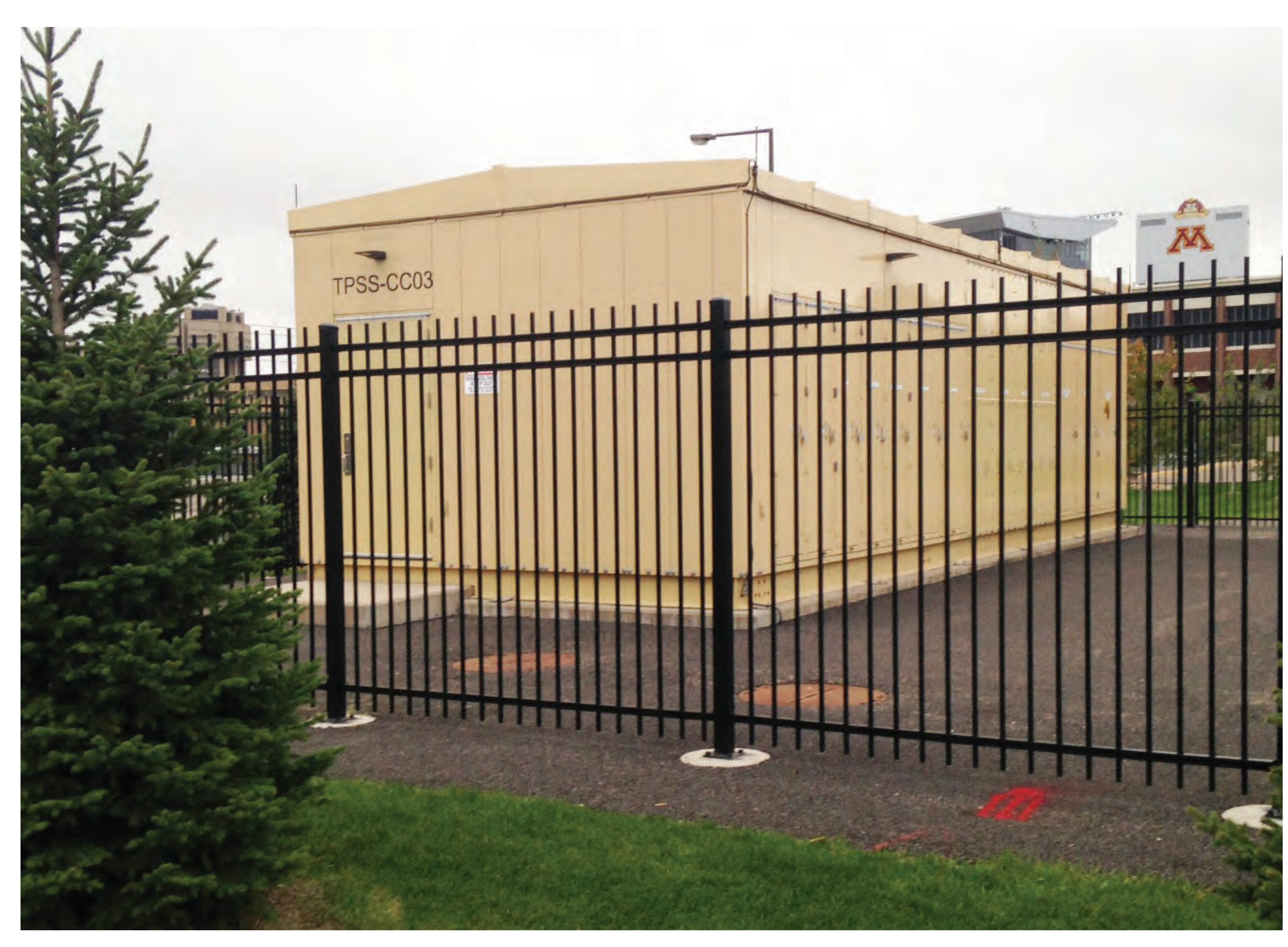
Existing TPSS along the Green Line