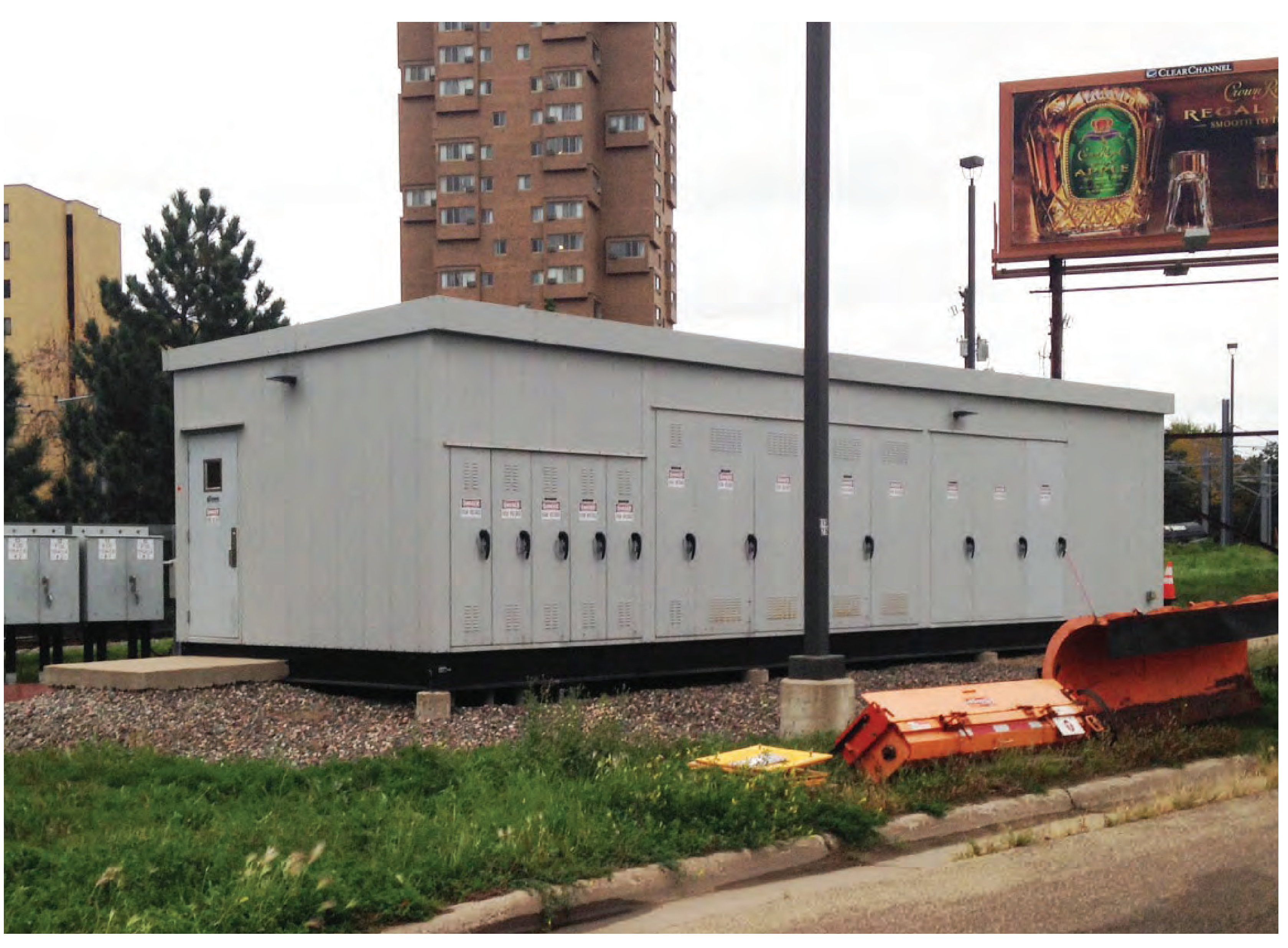
Existing TPSS along the Blue Line