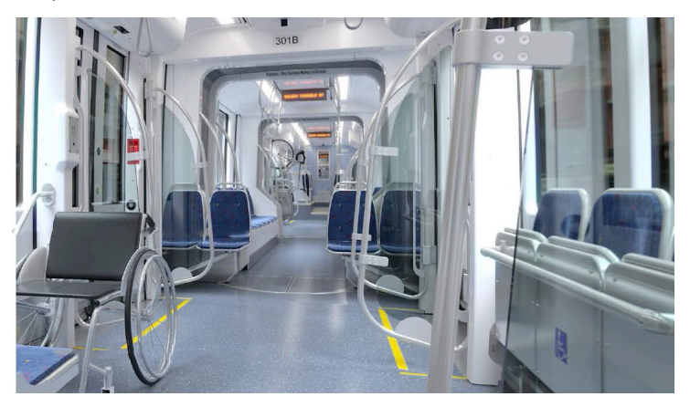
Light rail vehicle design includes space for passengers in wheelchairs and companion seating.

The redesign will have some seats running parallel along the middle vehicle walls facing each other. This increases circulation away from ADA-designated seating and allows for a wider path for users of some wheelchairs and walkers while keeping nearly the same number of seats.