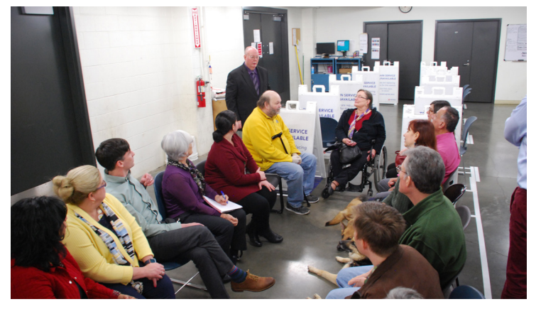
TAAC members experience full sized mockup of proposed vehicle design changes and meet project designers to offer their input.

Community feedback results in modifications to light rail trains' accessibility features