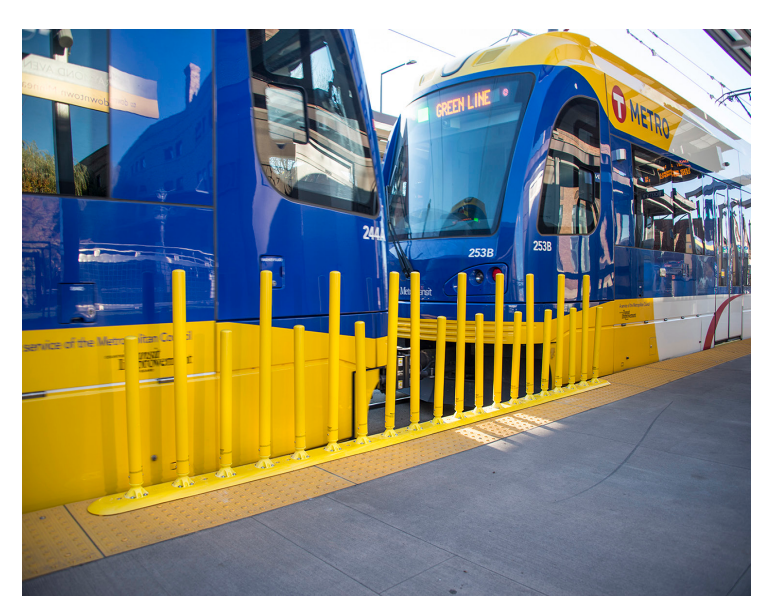
Stations include safety features such as between car bollards and tactile warning strips