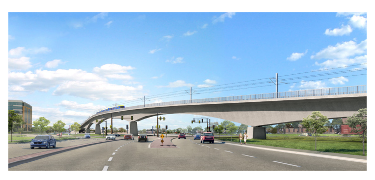
Rendering of the LRT bridge over Excelsior Blvd.

Revisions include refined freight rail coordination and maintenance elements, adjusted completion dates to allow