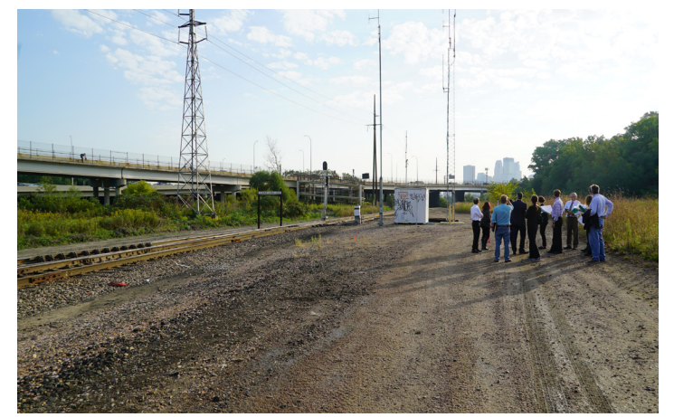
SWLRT project staff point out route and size of proposed wall to Minneapolis city staff

Three public tours and meetings with property owners, neighborhoods, policy makers and a community work group are providing design input on the proposed corridor protection wall.