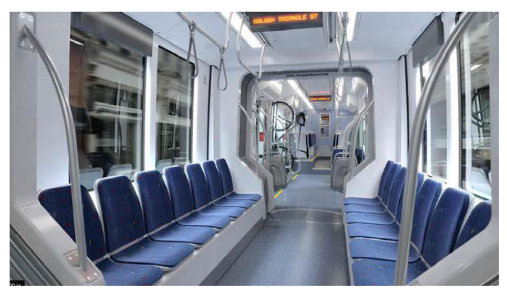
Design for center section of new light rail vehicles has seats facing each other which creates a wider aisle.

Designers met regularly with the public, including two key advisory committees, both LRT projects' Community Advisory Committees and the Metropolitan Council's Transportation Accessibility Advisory Committee. The TAAC is a 16-member committee made up of transit users and advocates for older people and the disability community, as well as representatives of service providers and other appropriate agencies.