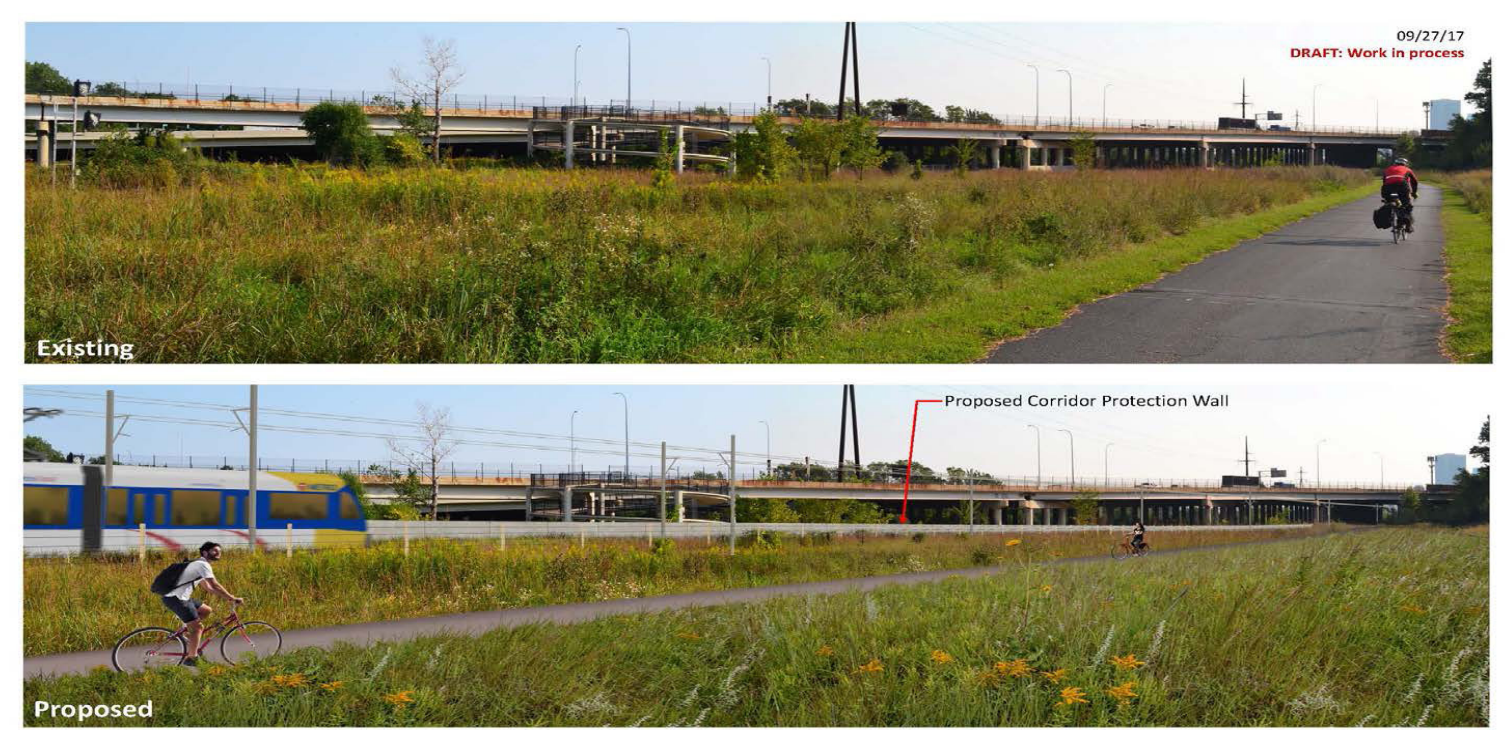
Exisiting (top) and planned with proposed wall (bottom) at the Bryn Mawr station area