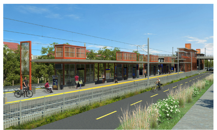
Rendering of the West Lake St. Station showing elevator tower

The stations for both LRT extension projects will include features to promote safety and accessibility for all.