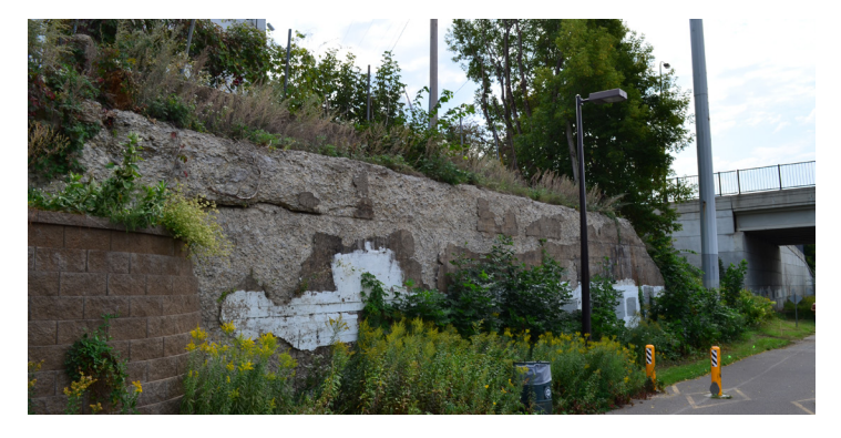
Remnants of a historic masonry retaining wall in the corridor protection area

As anticipated, the Federal Transit Administration this week found that a proposed corridor protection wall between Southwest LRT tracks and freight railroad tracks and other changes in Minneapolis would "adversely affect" a historic railroad district.