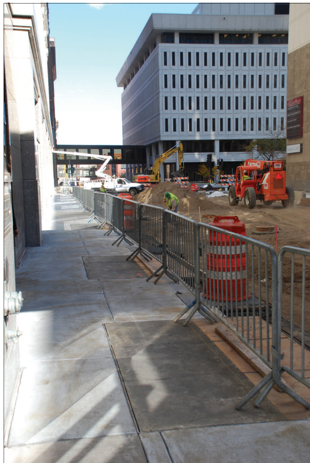
Top photo— Crews pour a new sidewalk in front of the federal courthouse at Fourth and Robert streets. Bottom photo — Sidewalks are repaved on the north side of Fourth Street between Robert and mid-block to Minnesota Street where people can enter and leave the First National Bank Building.