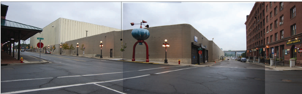
Vacant former Gillette Co. warehouse at Broadway and Prince streets in St. Paul

Crews will begin yard site prep work this fall on the maintenance facility and building renovations in early 2011 on the vacant former Gillette Co. warehouse. Meanwhile, MnDOT plans in January to start constructing the northbound bridge over the Mississippi River. MnDOT will start work on a southbound bridge in 2013 and remove the existing structure, which opened to traffic in 1968. The bridge is to be finished at the end of 2014, the same year that the LRT line is to begin service.