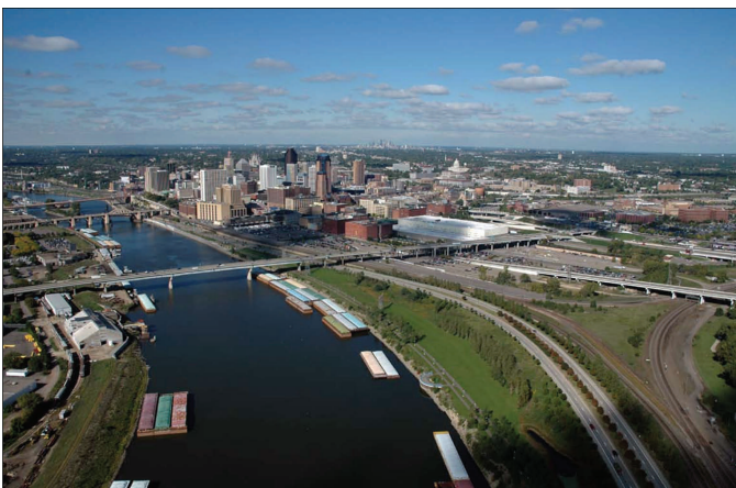
Current Lafayette freeway bridge.