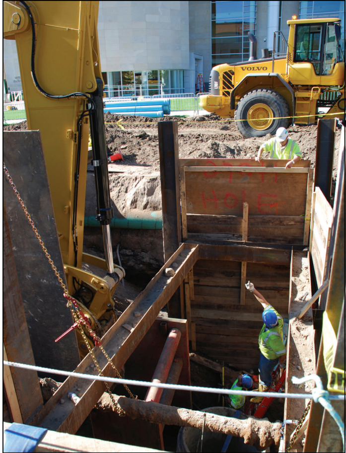
Top right photo—Walsh Construction crews set a manhole on Robert Street. Bottom photo—Construction is underway in front of the Orville Freeman State Office Building on Robert Street, site of the future Capitol East Station.