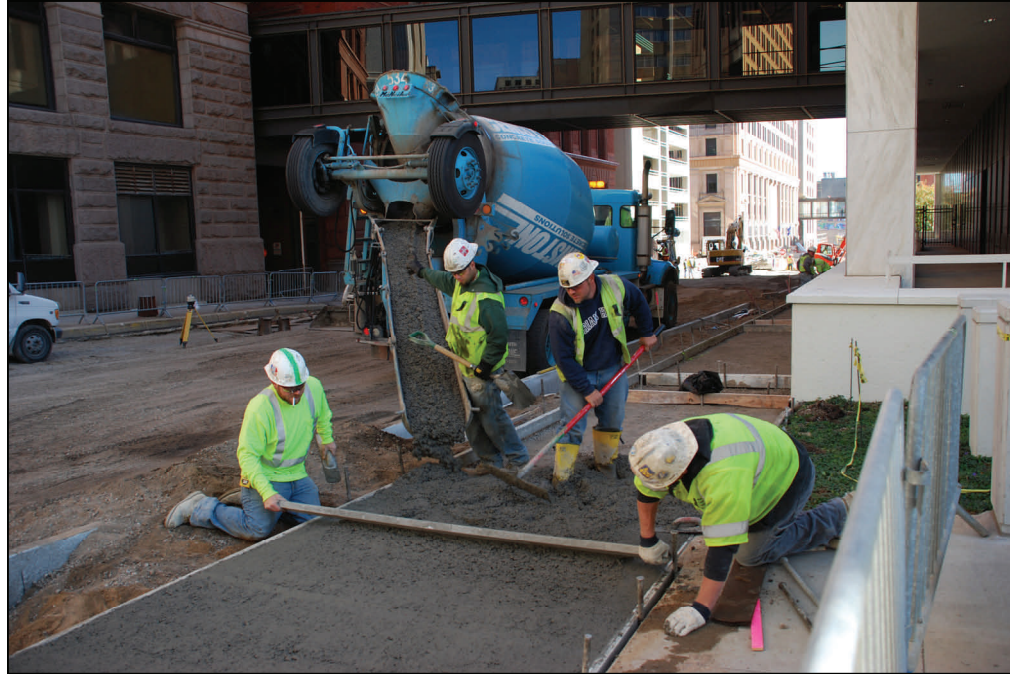
Fourth Street utility relocation, downtown St. Paul