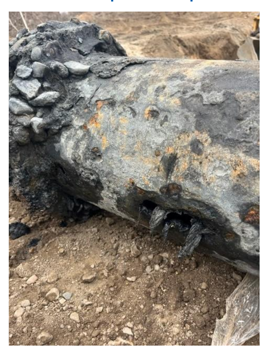
Deteriorated Siphon Pipe - Break