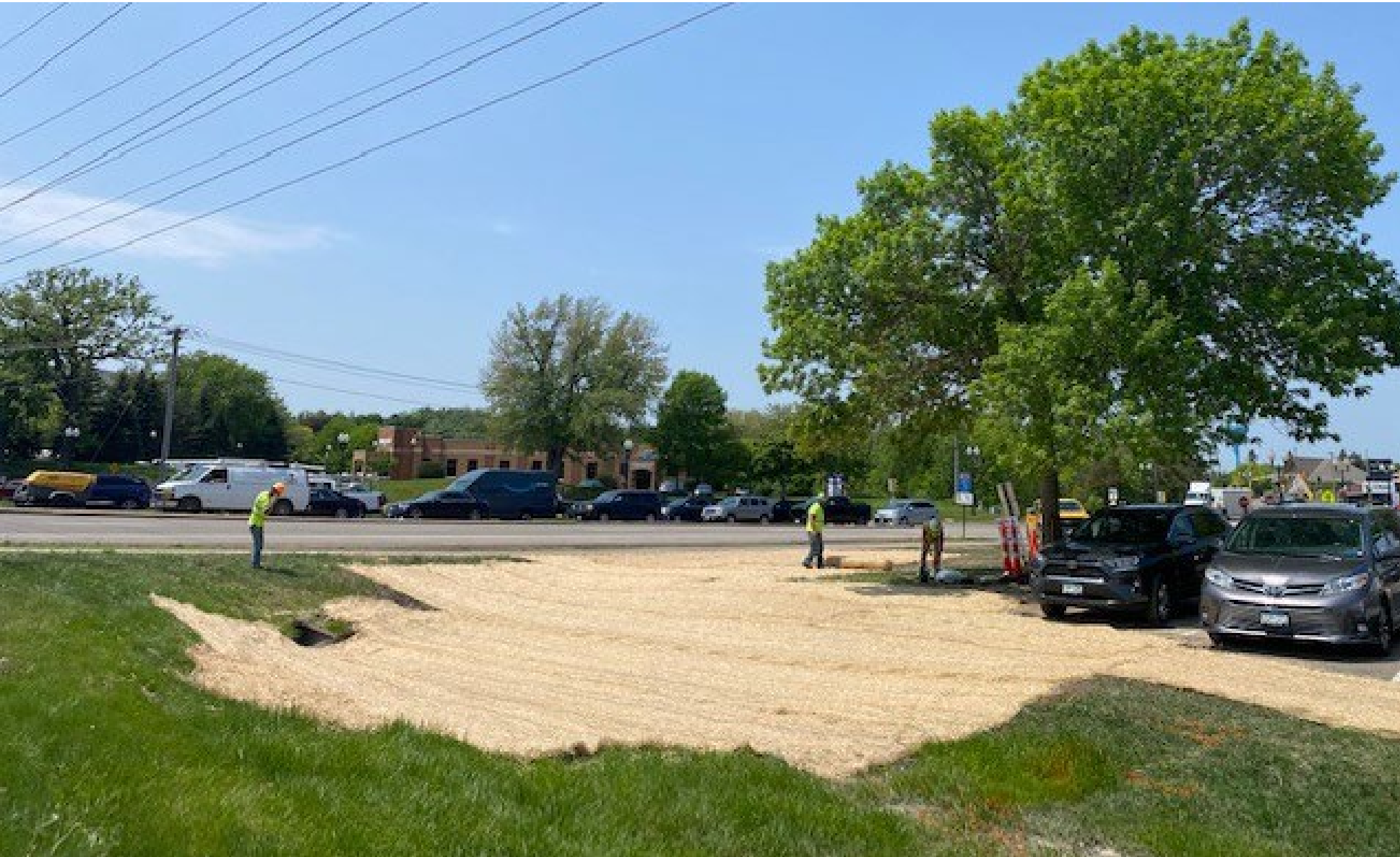
Restoration of the area after repair