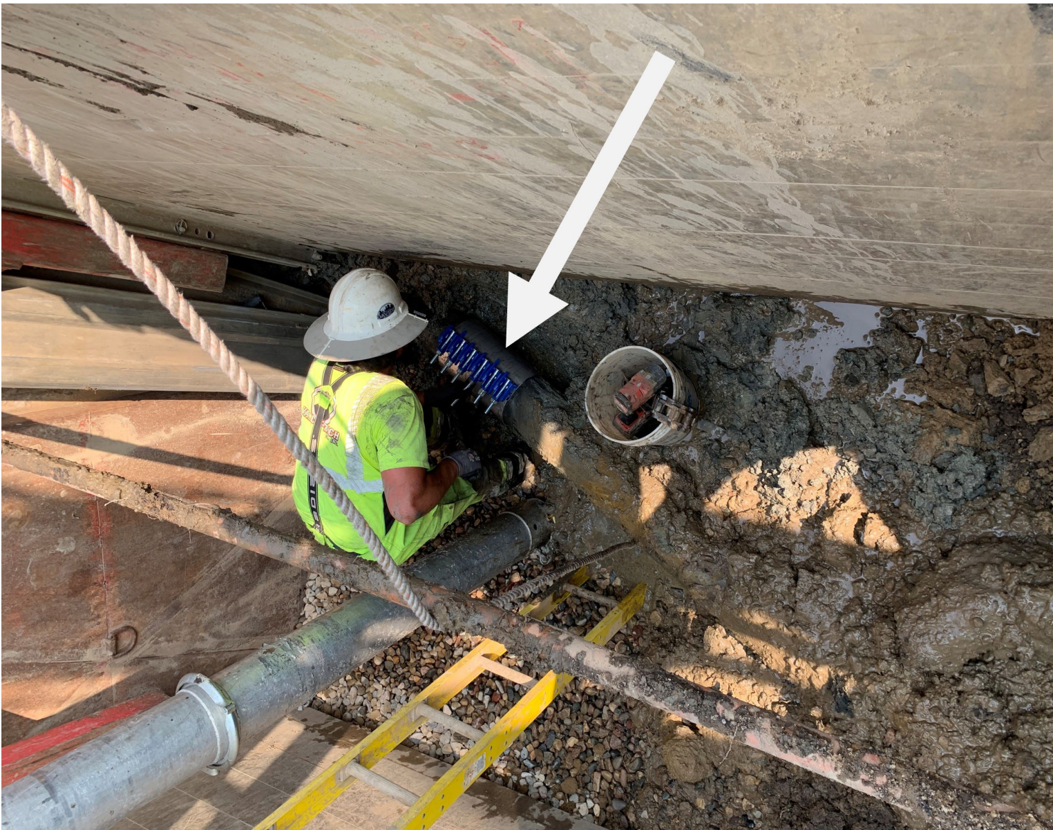
Repair Band Installation