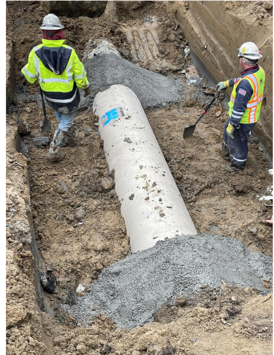
Interim repair of failed section