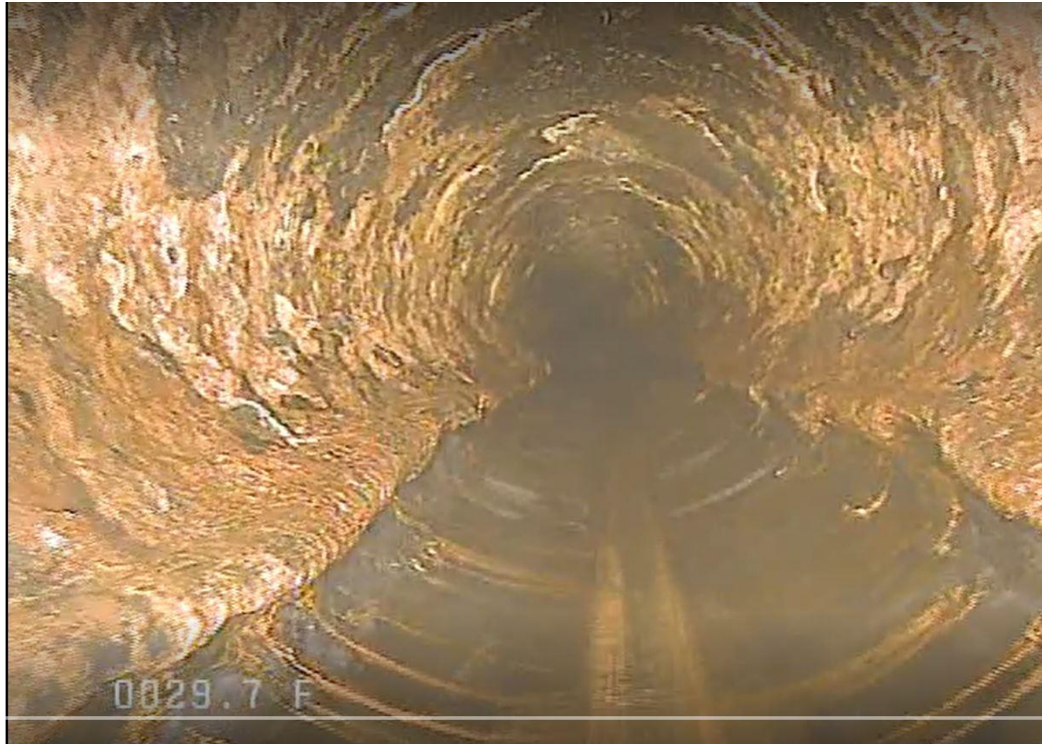
CCTV inspection post-excavation