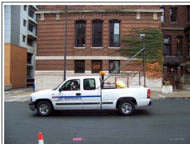
Engineers put a Hiawatha LRT horn and bell system on the back of a pickup to test noise impacts to Cedar Street buildings.

Vibration impacts will be less than they are today after proposed mitigation measures are employed by the Central Corridor LRT Project along Cedar Street in front of Minnesota Public Radio in St. Paul. Vibration mitigation measures will include installation of a 700-foot-long concrete “floating” slab under the track on Cedar Street to isolate vibration away from the MPR building, the Church of St. Louis King of France, Central Presbyterian Church, McNally Smith Recording Studios and the Fitzgerald Theater. Project engineers already have relocated a track crossover previously sited on Cedar Street in front of MPR to a location north of Interstate 94 where it will not affect noise and vibration sensitive or historic buildings. A crossover is a track structure that allows continuous passage between two nearby and generally parallel tracks. The proximity of the tracks, which are 14 feet from the closest point of MPR’s new building, makes vibration mitigation necessary.