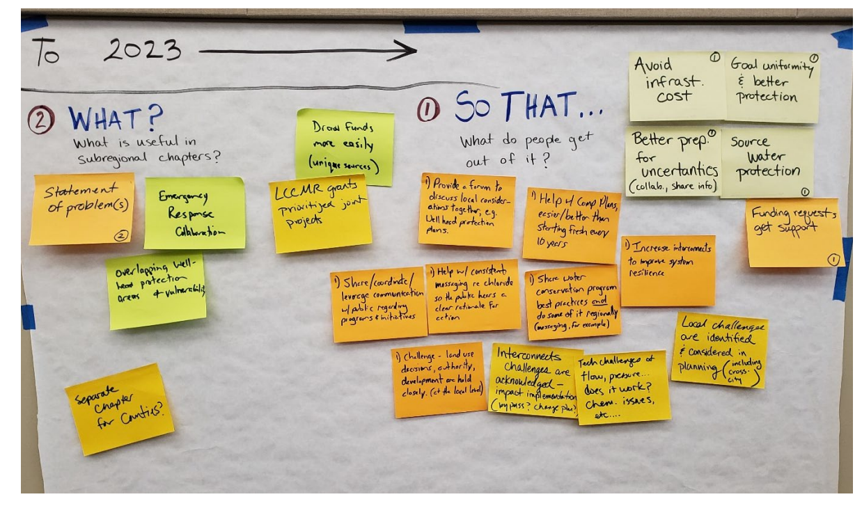
Figure 2. Poster two of two to support TAC discussion about a subregional approach.